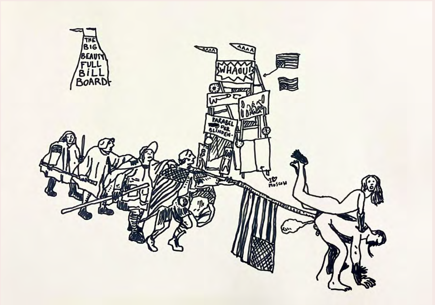
Damien Deroubaix.