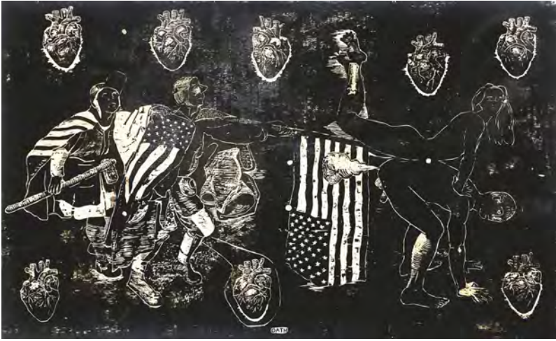
Damien Deroubaix, Parabole des aveugles , 2026, wood and ink, 125 x 203,5 cm, courtesy of Nosbaum Reding