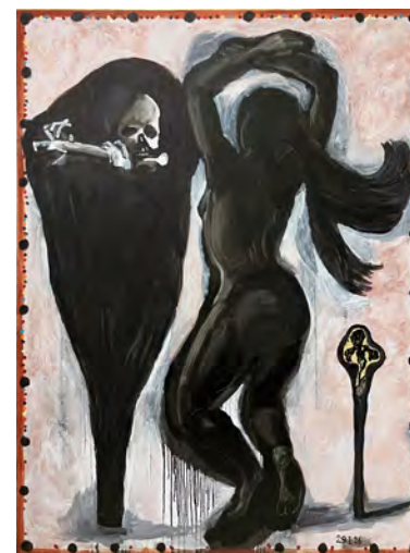
Damien Deroubaix, Dancing on glass 5 , 2026, oil and collage on canvas, 200 x 150 cm, courtesy of Nosbaum Reding