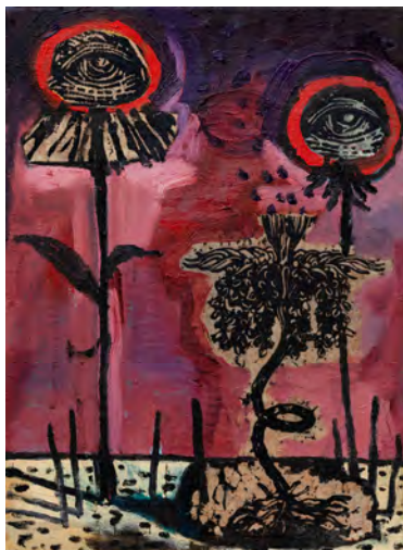
Damien Deroubaix, Wunder der Natur , 2024, oil and collage on canvas, 33 x 24 cm

High-definition images available for download here