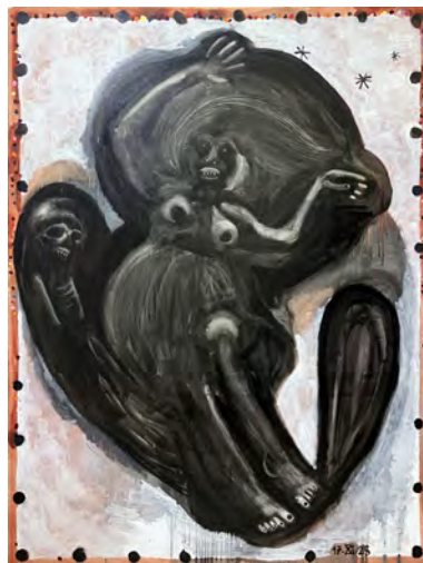
Damien Deroubaix, Dancing on glass 3 , 2026, oil and collage on canvas, 200 x 150 cm