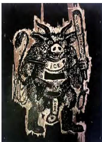
Damien Deroubaix, Ice , 2026, wood and ink, 87 x 63 cm, courtesy of Nosbaum Reding