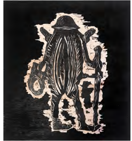
Damien Deroubaix, Bonjour monsieur Courbet , 2026, wood and ink, 67 x 61 cm, courtesy of Nosbaum Reding