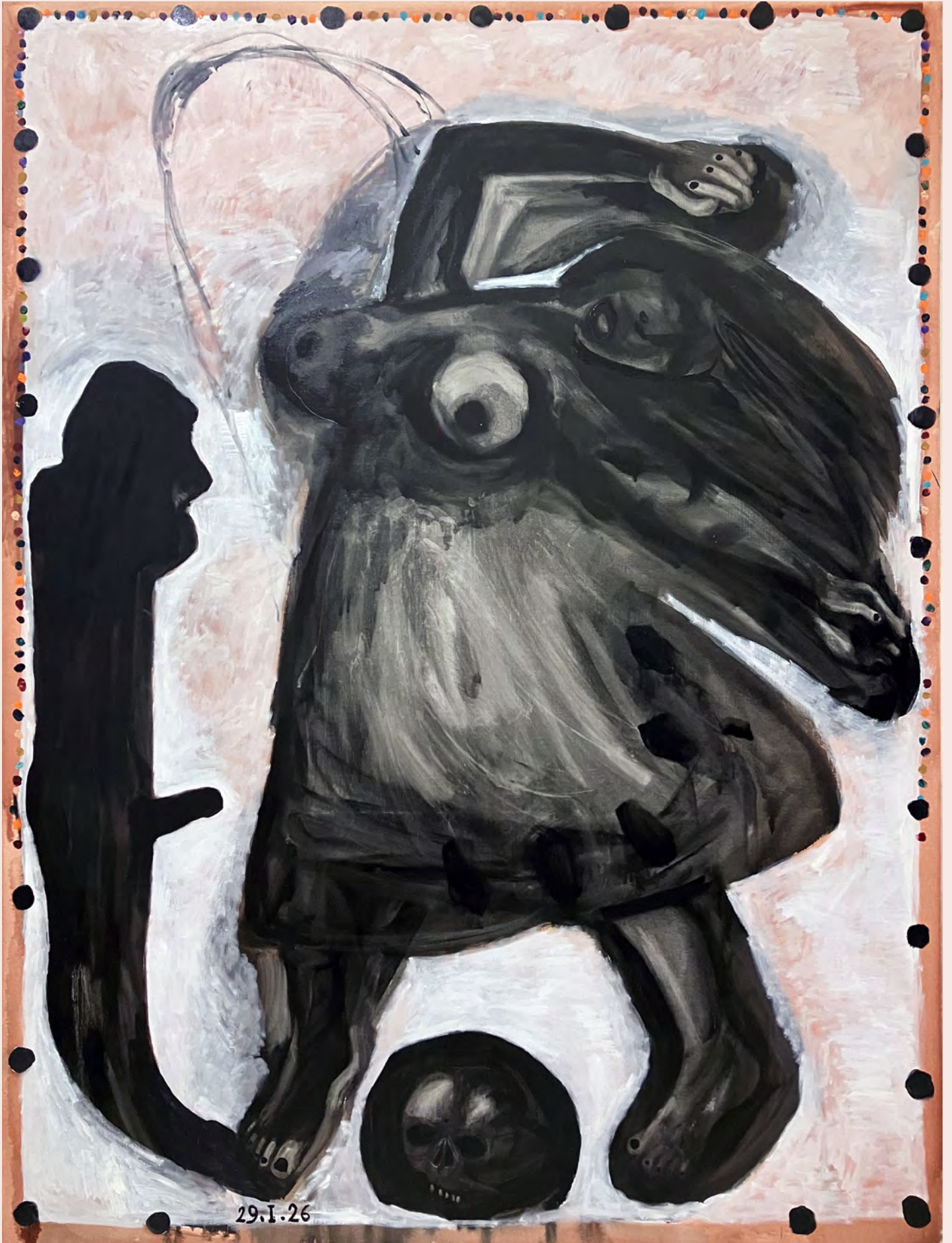
Damien Deroubaix, Dancing on glass 4 , 2026, oil and collage on canvas, 200 x 150 cm, courtesy of Nosbaum Reding © Damien Deroubaix