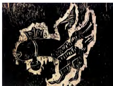
Damien Deroubaix, Donald , 2026, wood and ink, 46,5 x 62,5 cm