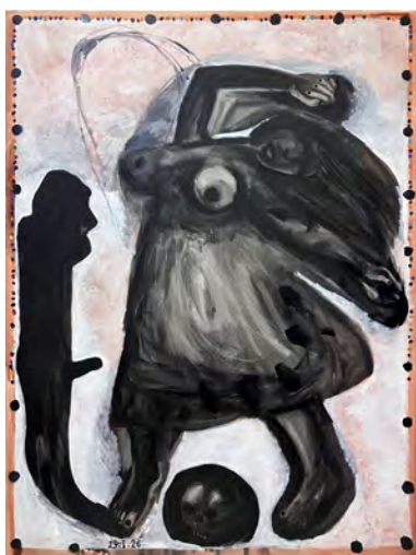
Damien Deroubaix, Dancing on glass 4 , 2026, oil and collage on canvas, 200 x 150 cm