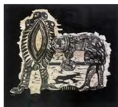
Damien Deroubaix, Asset , 2026, wood and ink, 58 x 64,5 cm, courtesy of Nosbaum Reding