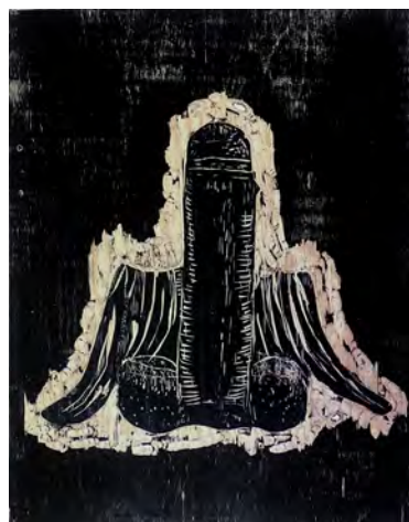
Damien Deroubaix, Rocket to Russia , 2026, wood and ink, 61 x 48 cm, courtesy of Nosbaum Reding