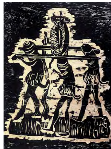
Damien Deroubaix, Cult , 2026, wood and ink, 62,5 x 46,5 cm, courtesy of Nosbaum Reding