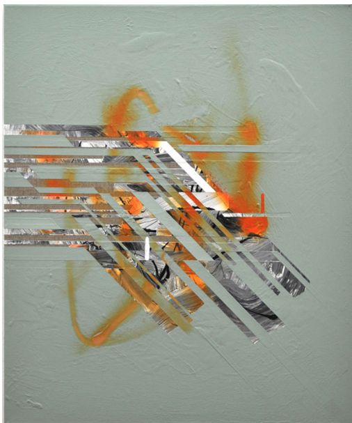
Works in at least two dimensions Exhibition View Nosbaum Reding, Luxembourg, 2013