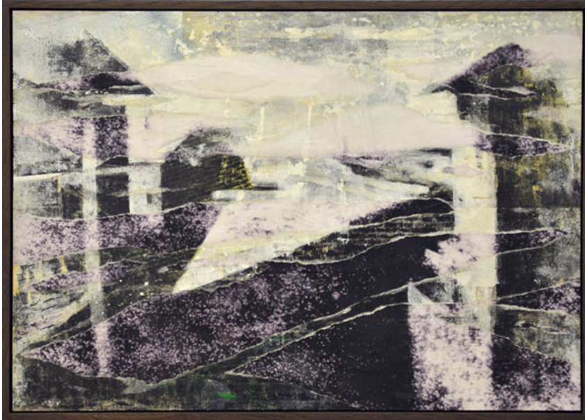
Works in at least two dimensions Exhibition View Nosbaum Reding, Luxembourg, 2013