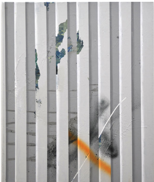
Works in at least two dimensions Exhibition View Nosbaum Reding, Luxembourg, 2013