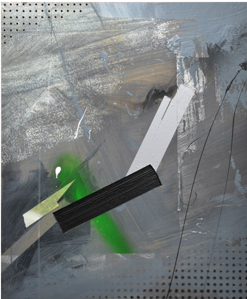
Works in at least two dimensions Exhibition View Nosbaum Reding, Luxembourg, 2013