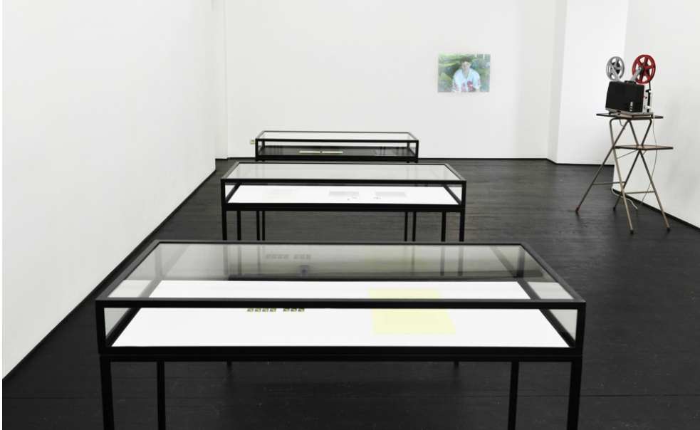
Murder, She Wrote Exhibition View Nosbaum Reding, Luxembourg, 2014