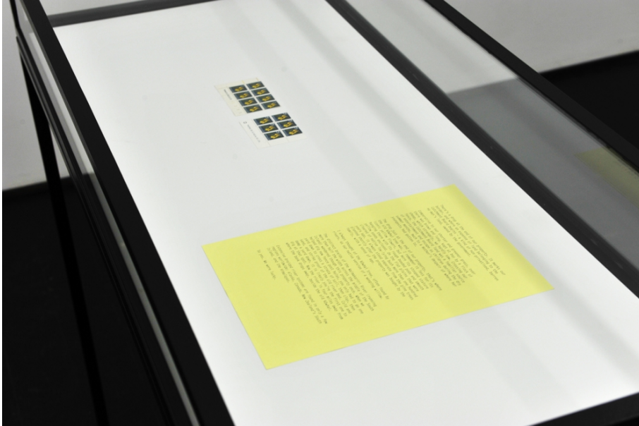
Murder, She Wrote Exhibition View Nosbaum Reding, Luxembourg, 2014