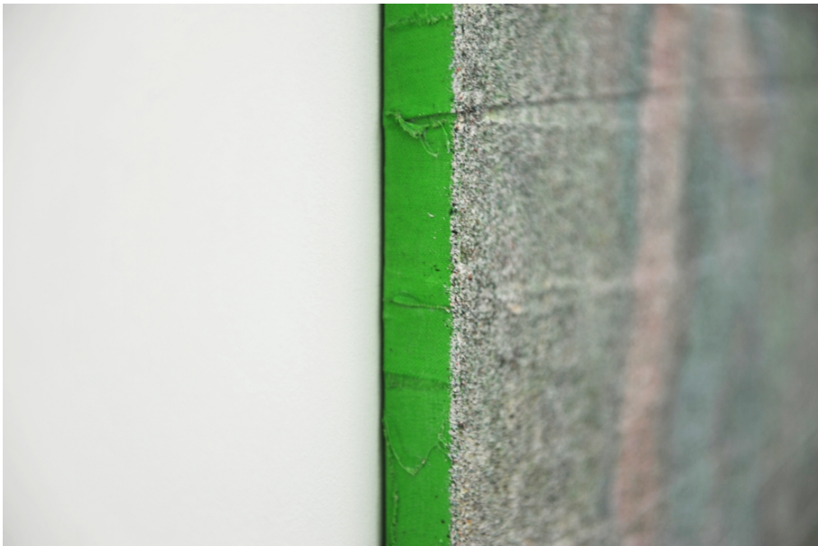
Murder, She Wrote Exhibition View Nosbaum Reding, Luxembourg, 2014