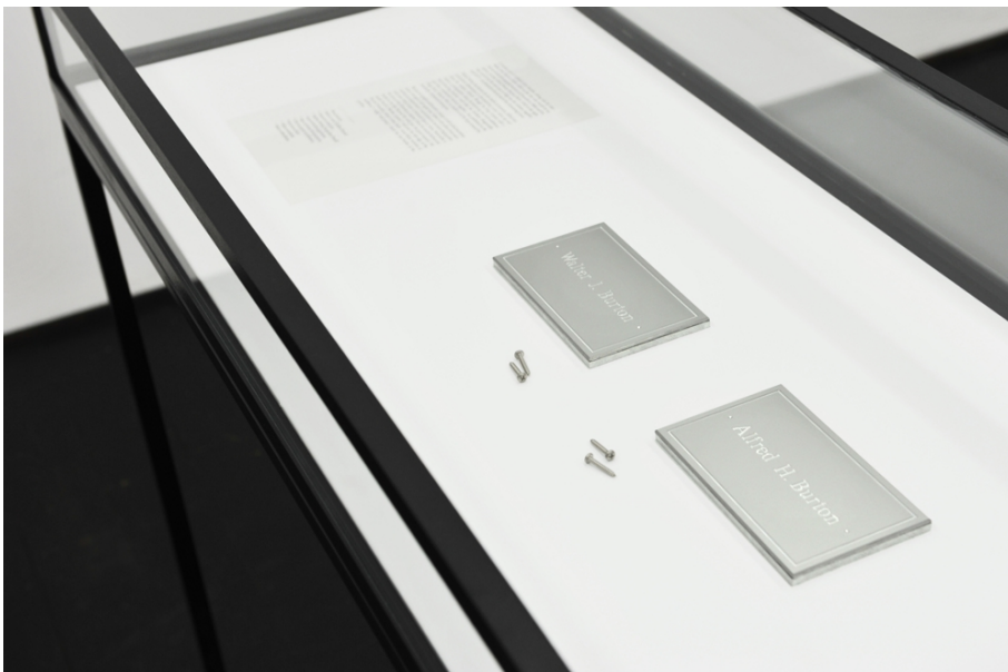
Murder, She Wrote Exhibition View Nosbaum Reding, Luxembourg, 2014