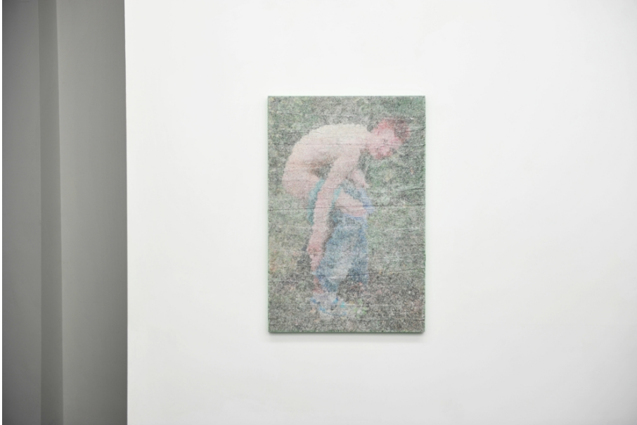
Murder, She Wrote Exhibition View Nosbaum Reding, Luxembourg, 2014