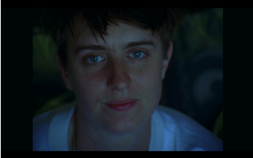
Murder, She Wrote Exhibition View Nosbaum Reding, Luxembourg, 2014