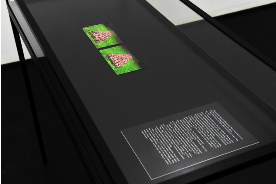
Murder, She Wrote Exhibition View Nosbaum Reding, Luxembourg, 2014