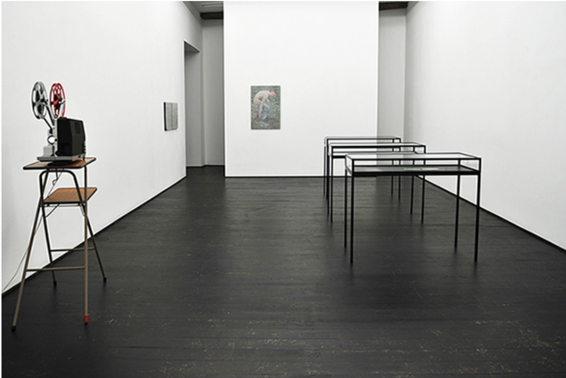
Murder, She Wrote Exhibition View Nosbaum Reding, Luxembourg, 2014