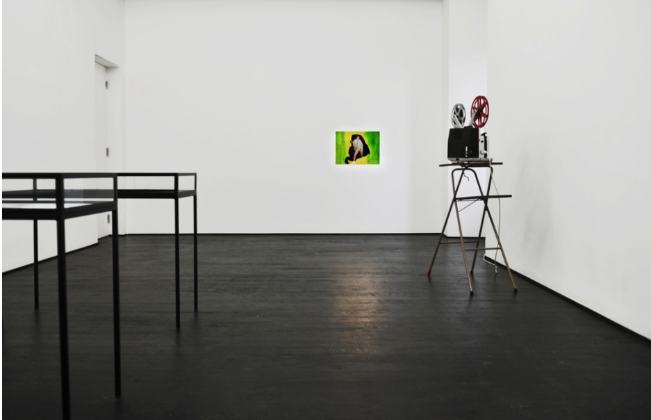
Murder, She Wrote Exhibition View Nosbaum Reding, Luxembourg, 2014