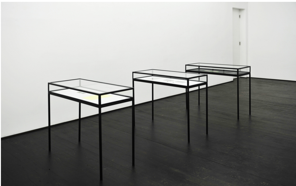
Murder, She Wrote Exhibition View Nosbaum Reding, Luxembourg, 2014