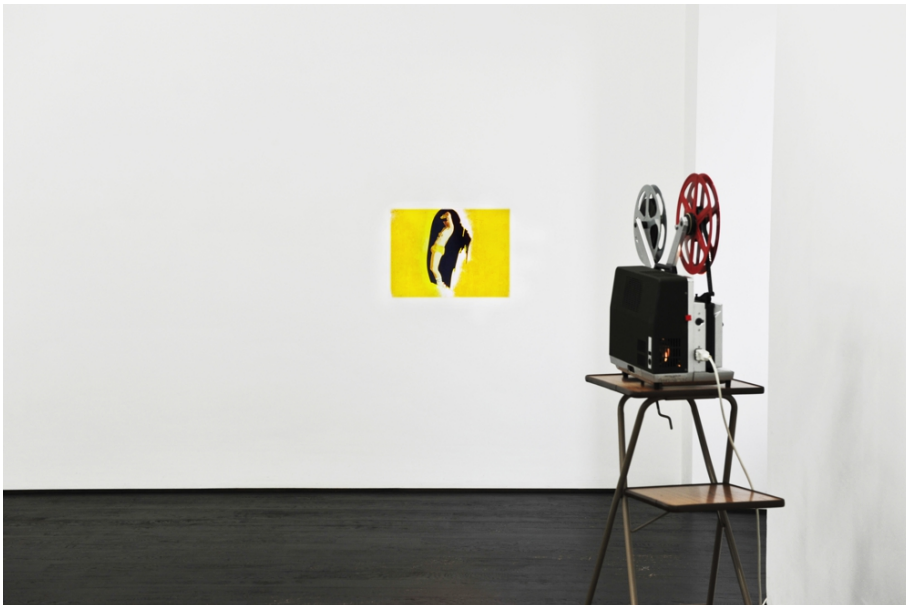
Murder, She Wrote Exhibition View Nosbaum Reding, Luxembourg, 2014