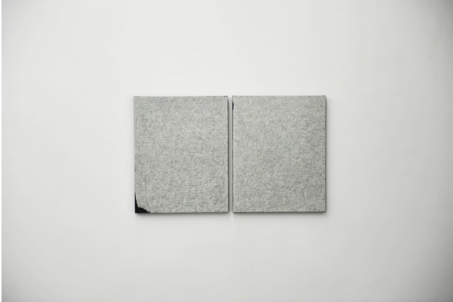
Murder, She Wrote Exhibition View Nosbaum Reding, Luxembourg, 2014