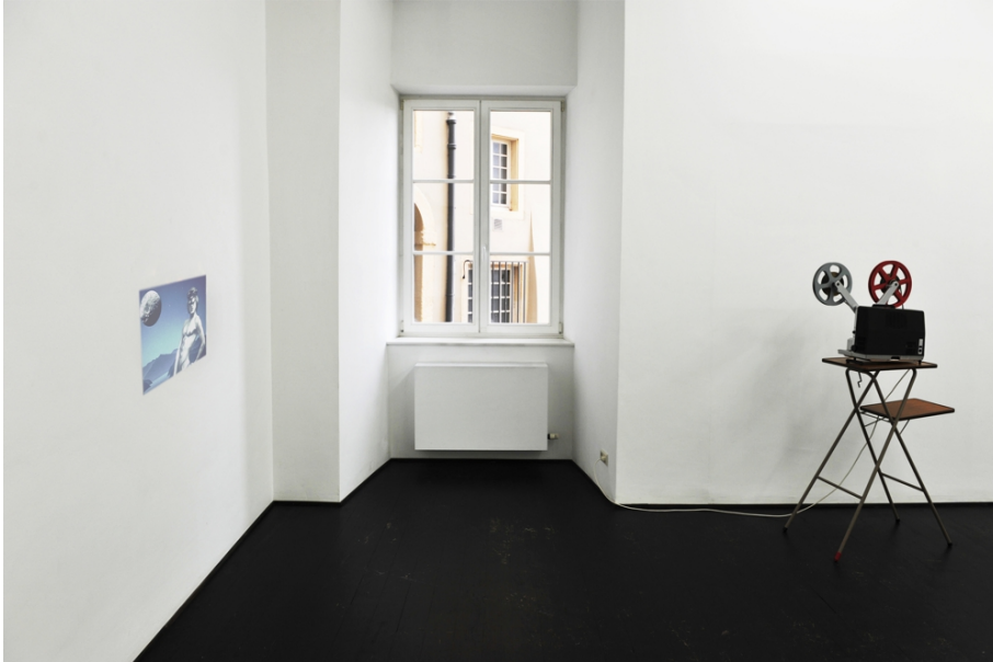
Murder, She Wrote Exhibition View Nosbaum Reding, Luxembourg, 2014