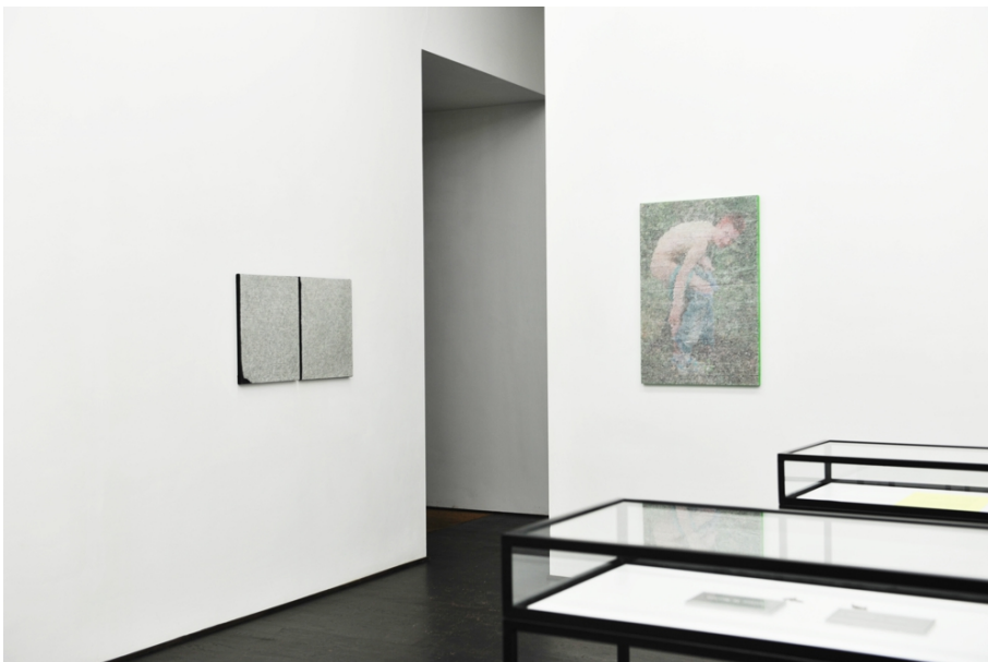
Murder, She Wrote Exhibition View Nosbaum Reding, Luxembourg, 2014