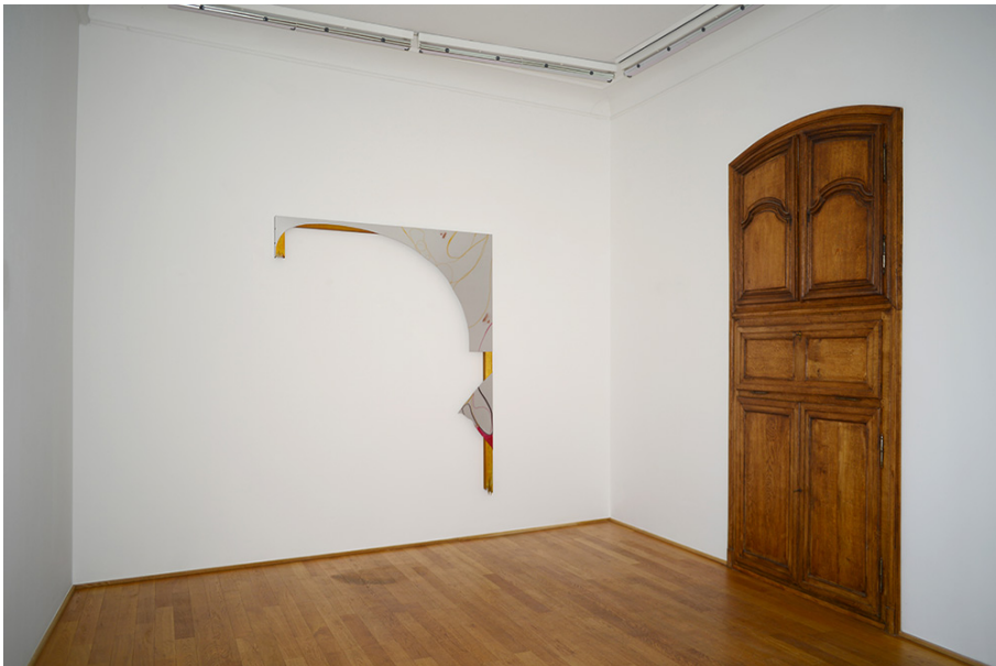
SWIM Exhibition View Nosbaum Reding, Luxembourg, 2016