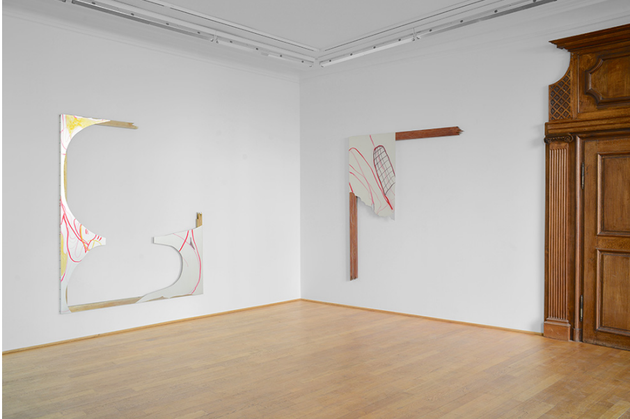
SWIM Exhibition View Nosbaum Reding, Luxembourg, 2016