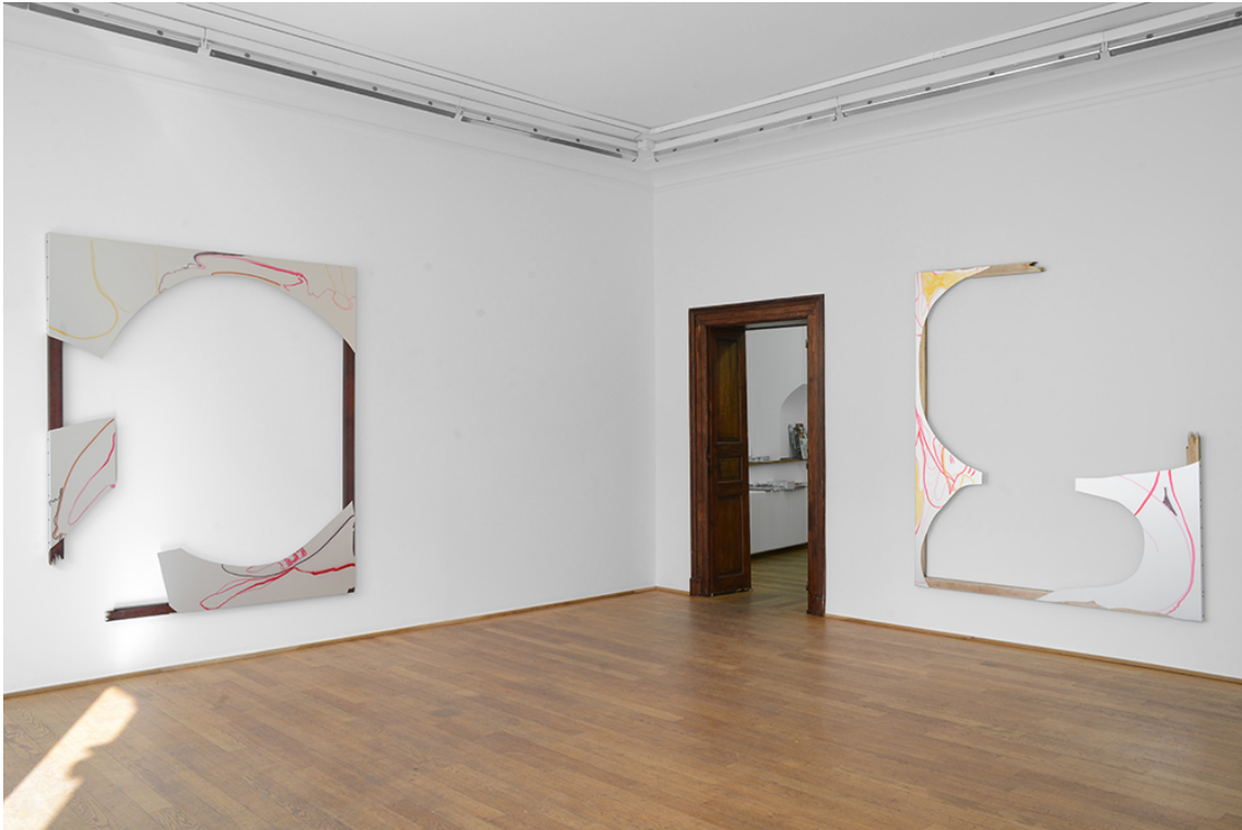
SWIM Exhibition View Nosbaum Reding, Luxembourg, 2016