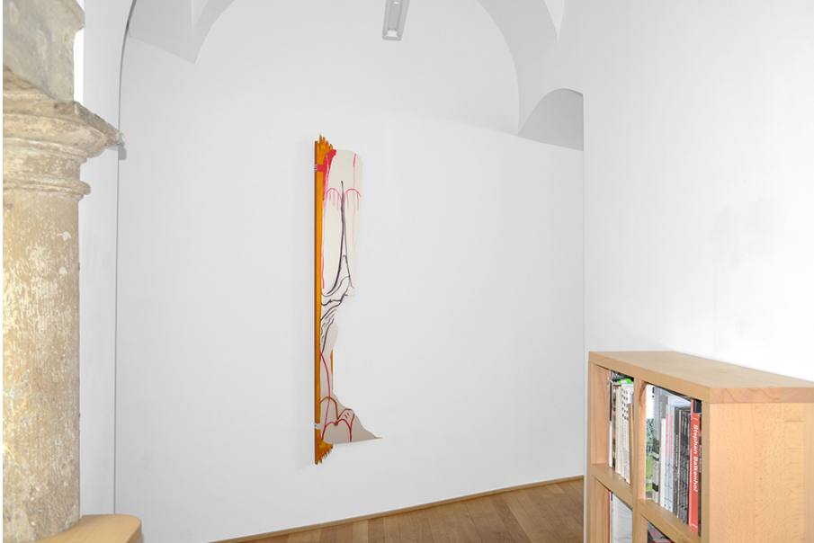
SWIM Exhibition View Nosbaum Reding, Luxembourg, 2016