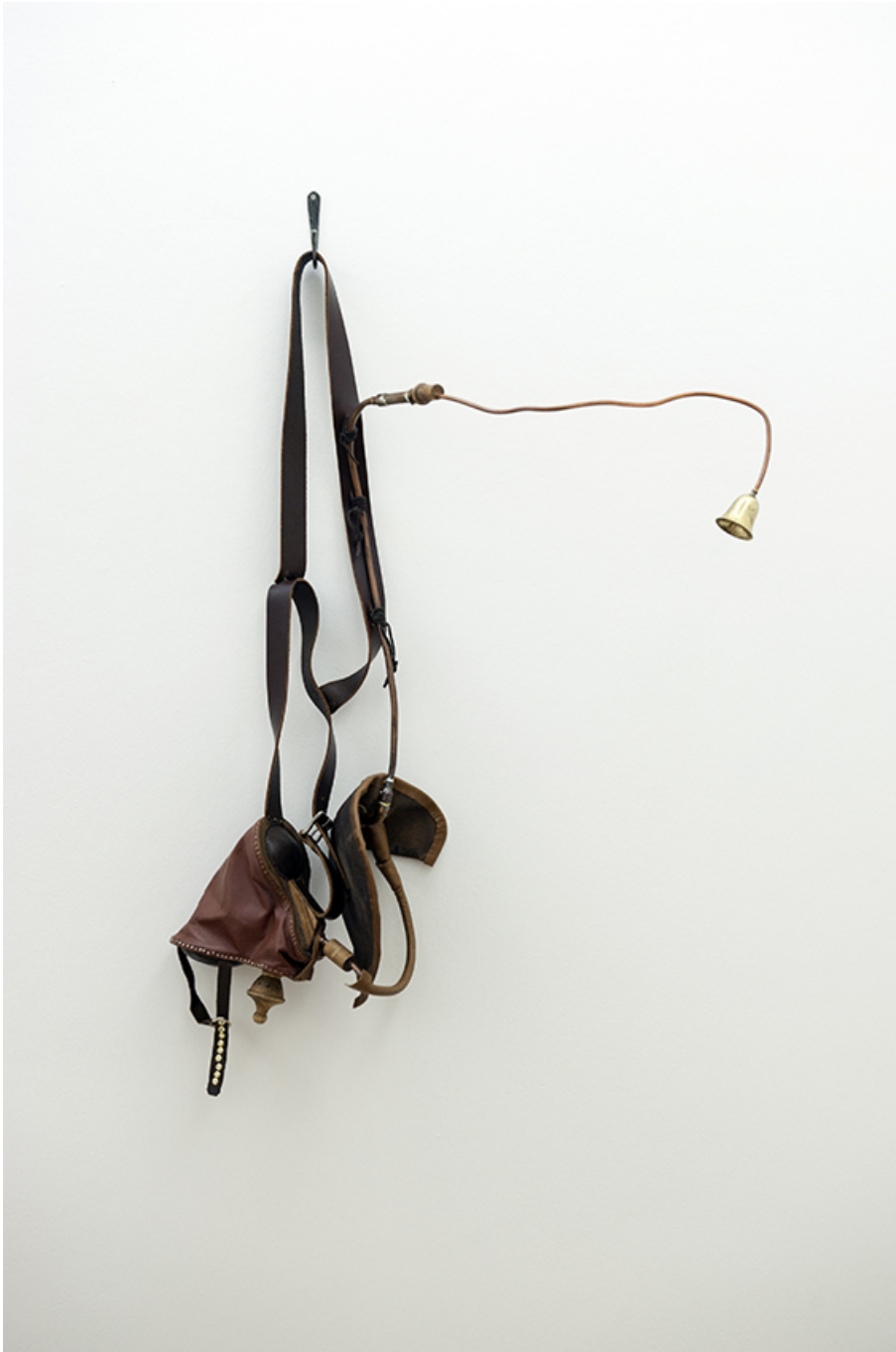
Introducing myself to the Canada geese , 2012