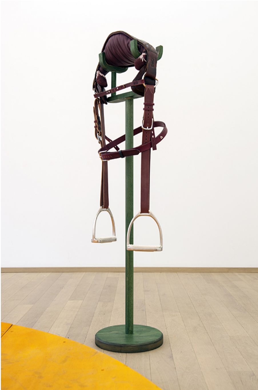
no melon , 2015 - 2018 Wearing wood, leather, embraces curtains, stirrups, metal hardware 130 x 141 x 27 cm