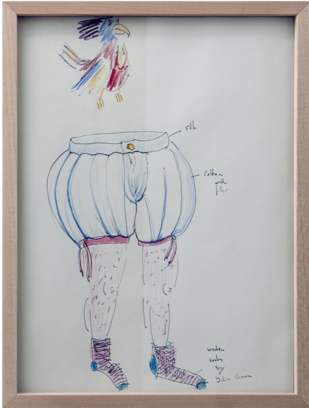
Preparation drawing for The wellbeing of things : a 5km race, 2016