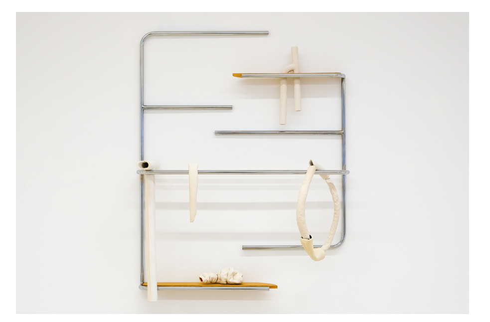
Multiforme Exhibition View Nosbaum Reding, Luxembourg, 2022