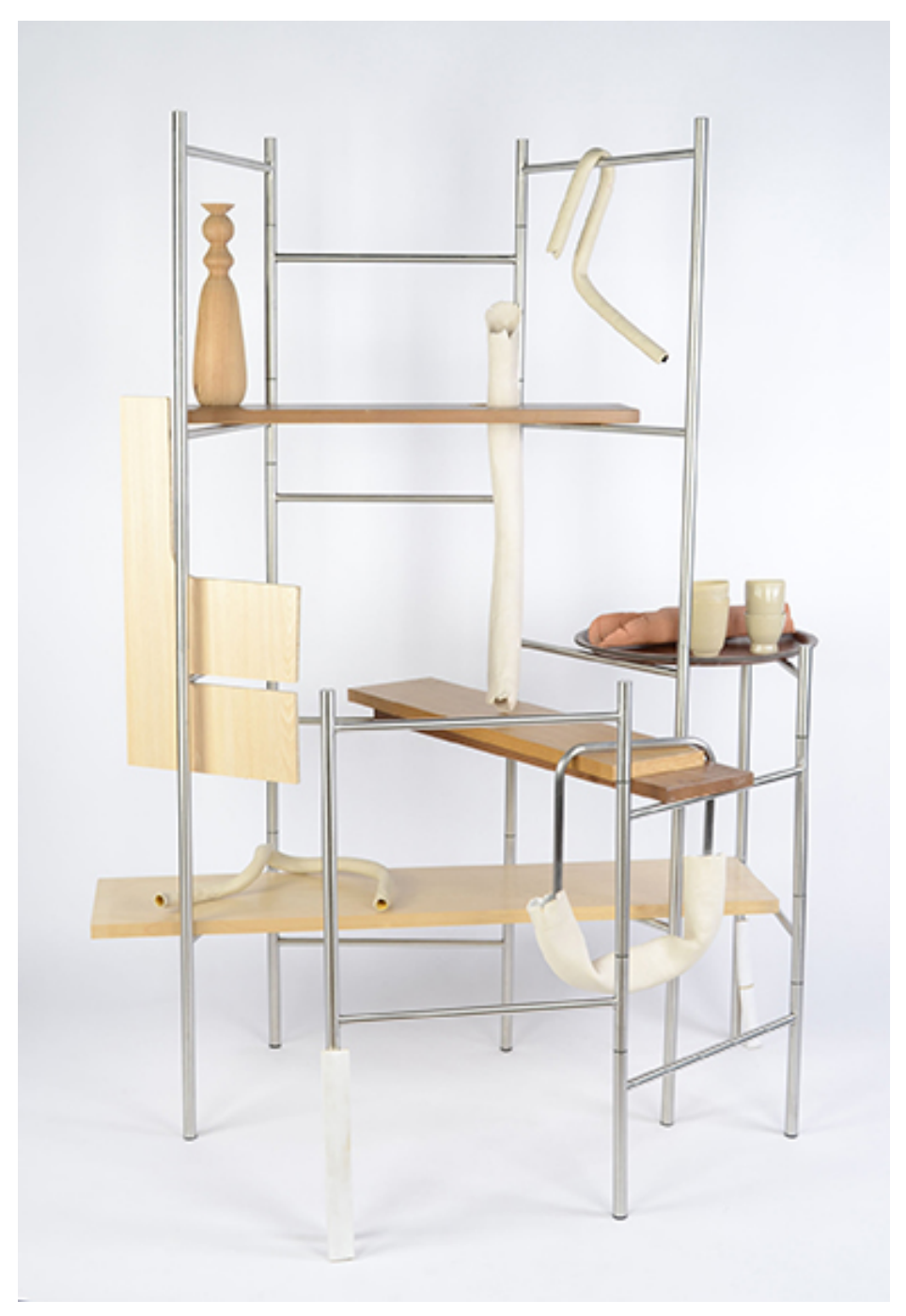
Rack I , 2018 Galvanized steel, wood, laminated board and ceramics 66.93 x 51.18 x 39.37 in ( 170 x 130 x 100 cm )