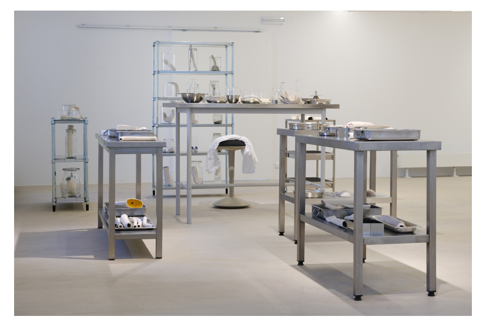
Multiforme Exhibition View Nosbaum Reding, Luxembourg, 2022