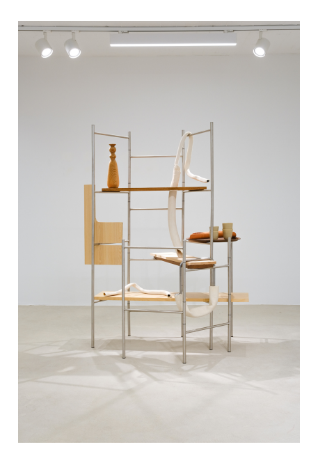
Multiforme Exhibition View Nosbaum Reding, Luxembourg, 2022