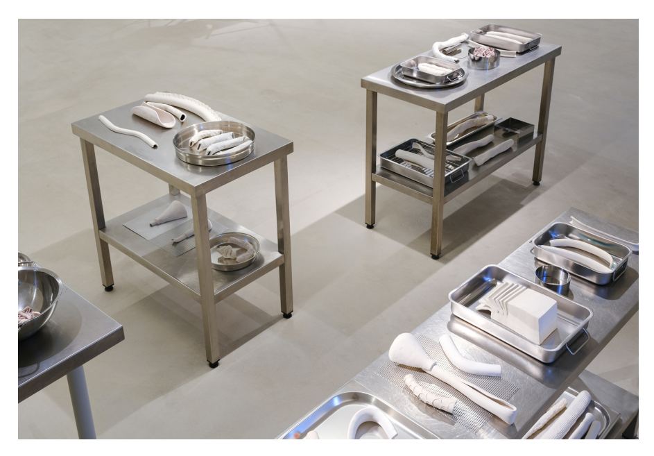
Multiforme Exhibition View Nosbaum Reding, Luxembourg, 2022