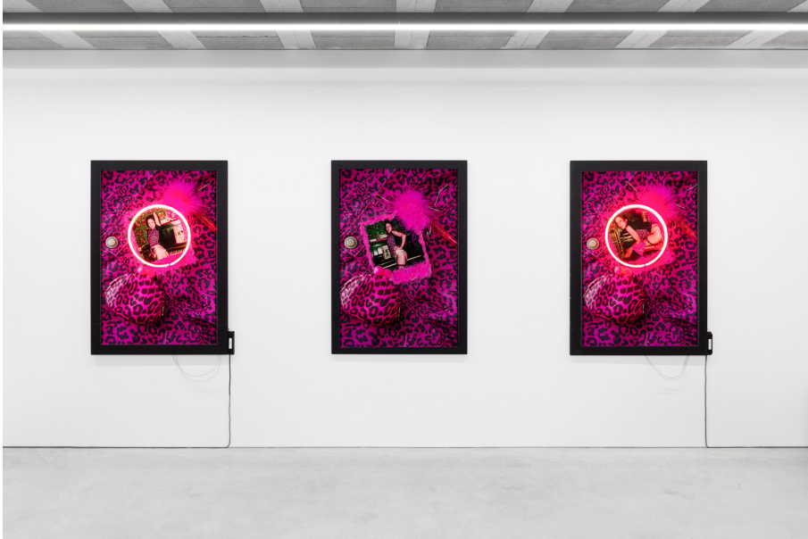
Exhibition View Nosbaum Reding, Luxembourg, 2025