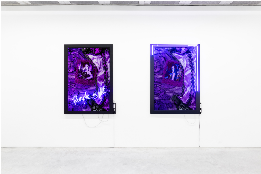
Exhibition View Nosbaum Reding, Luxembourg, 2025