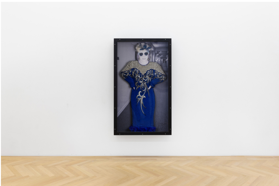
Exhibition View Nosbaum Reding, Luxembourg, 2025