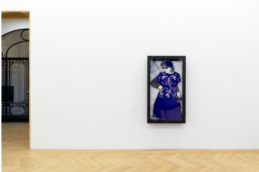
Exhibition View Nosbaum Reding, Luxembourg, 2025