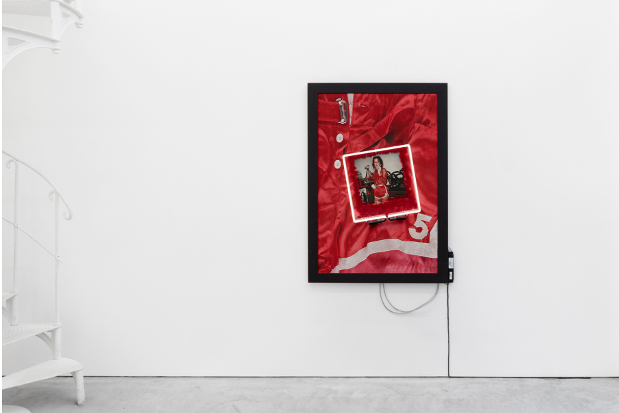
Exhibition View Nosbaum Reding, Luxembourg, 2025