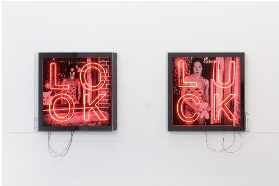
Exhibition View Nosbaum Reding, Luxembourg, 2025