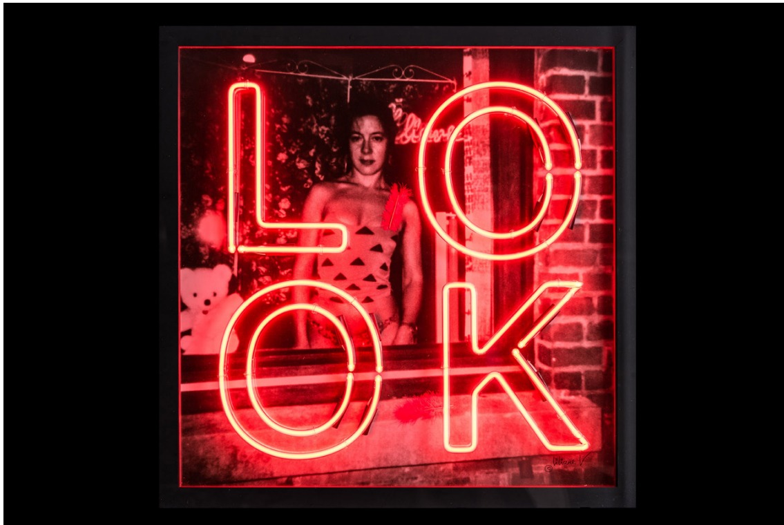
Look , 1980 black and white photo, neon, wooden frame, perspex cap 40.16 x 39.37 x 4.72 in ( 102 x 100 x 12 cm )