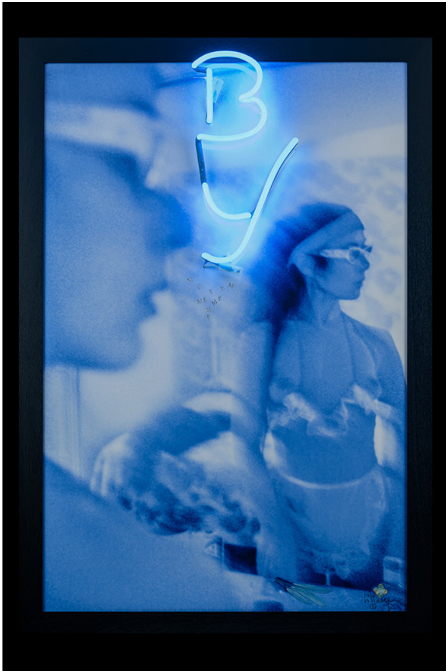
BY(E) , 1994 Blue photograph, plexiglas, neon, transformer, framed 60.63 x 41.73 x 3.94 in ( 154 x 106 x 10 cm )