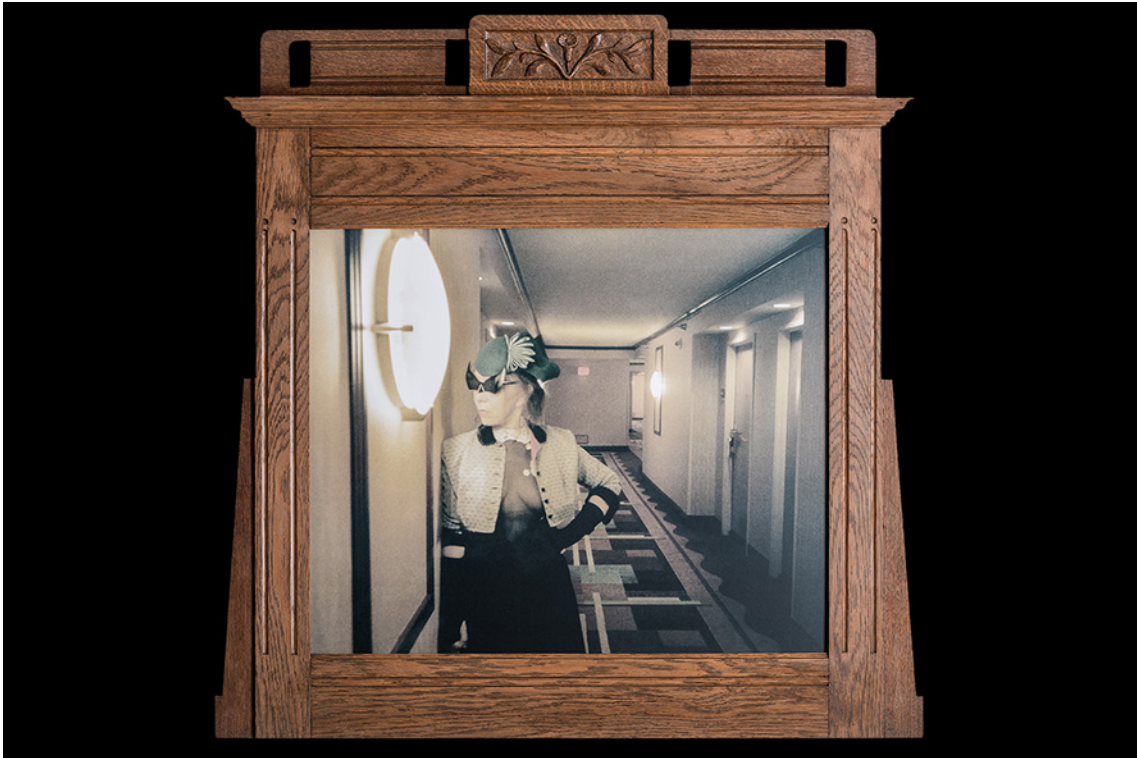
NY NY in LV , 2008 Photograph, antique frame 35.43 x 37.4 x 1.18 in ( 90 x 95 x 3 cm )