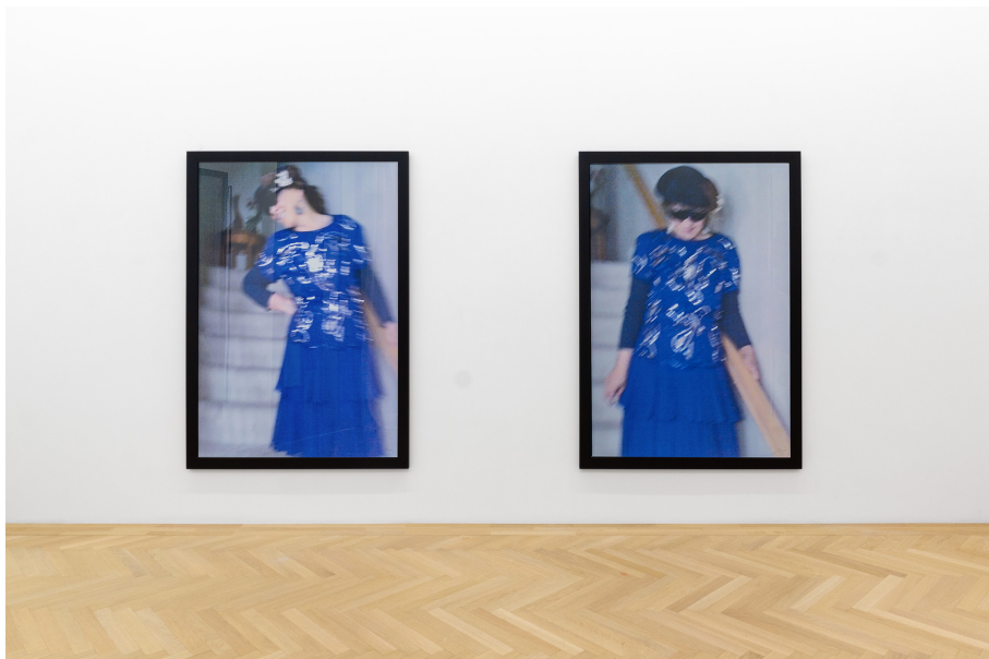
Exhibition View Nosbaum Reding, Luxembourg, 2025