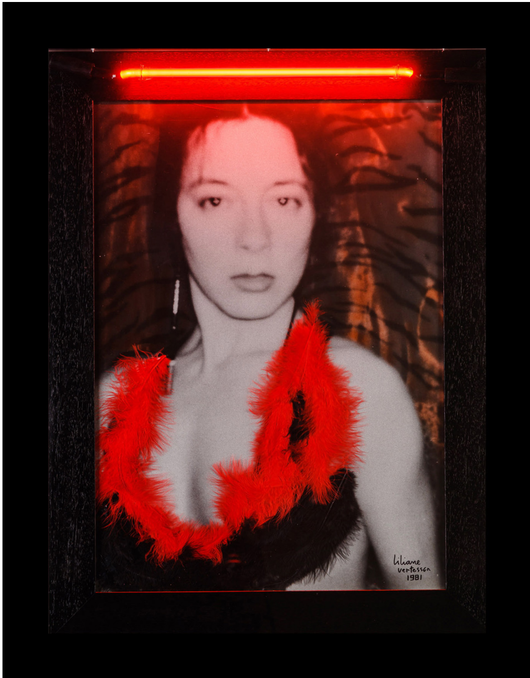
Stars in my eyes , 1981

black and white photo, red feathers, neon, wooden frame, perspex cap 33.07 x 25.2 x 4.72 in ( 84 x 64 x 12 cm )