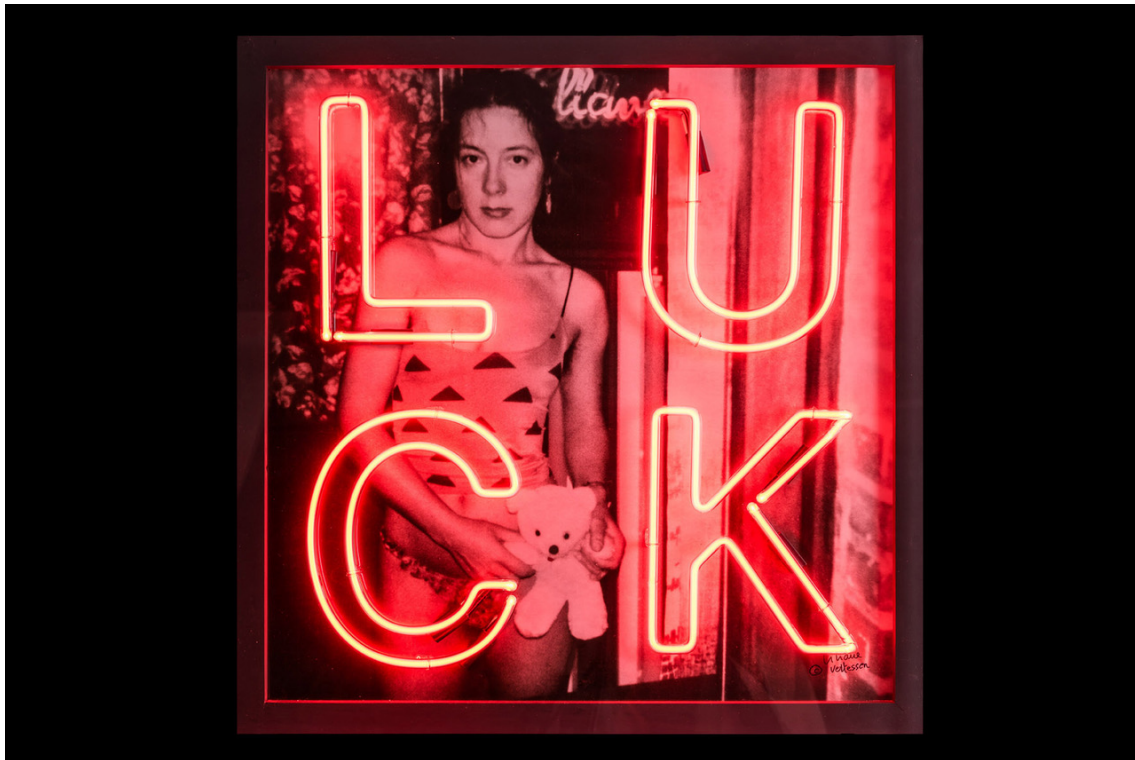
Luck , 1980 black and white photo, neon, wooden frame, perspex cap 40.16 x 39.37 x 4.72 in ( 102 x 100 x 12 cm )