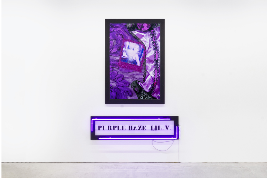
Exhibition View Nosbaum Reding, Luxembourg, 2025