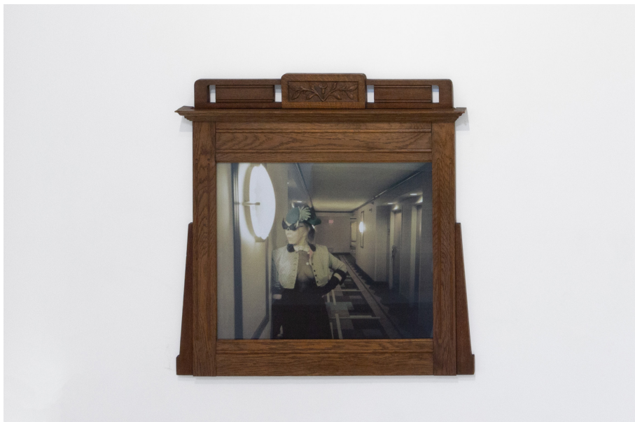
Exhibition View Nosbaum Reding, Luxembourg, 2025