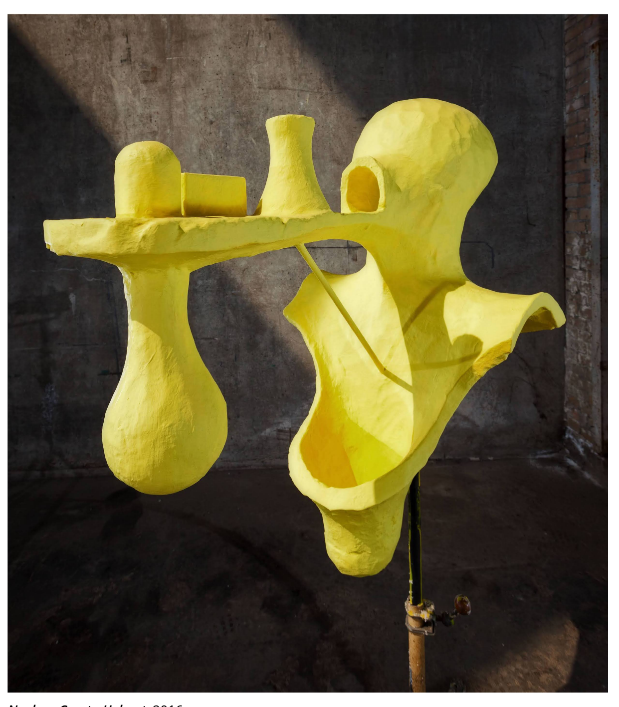
Nuclear Crypto Helmet, 2016 Mixed Media 37.01 \times 22.05 \times 62.99 in ( 94 \times 56 \times 160 cm )