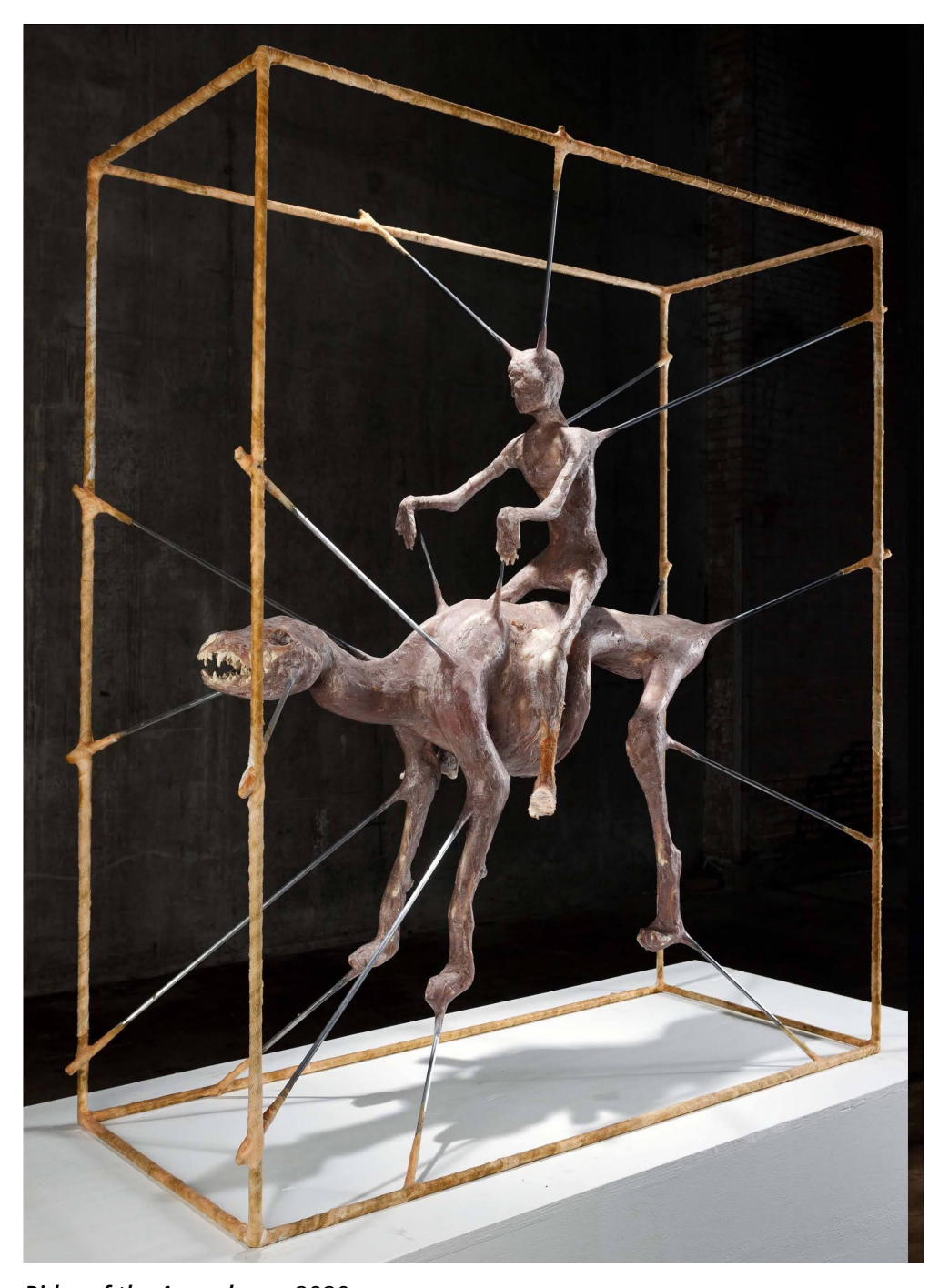
Rider of the Apocalypse, 2020 Mixed Media 51.57 \times 22.05 \times 57.09 in ( 131 \times 56 \times 145 cm )