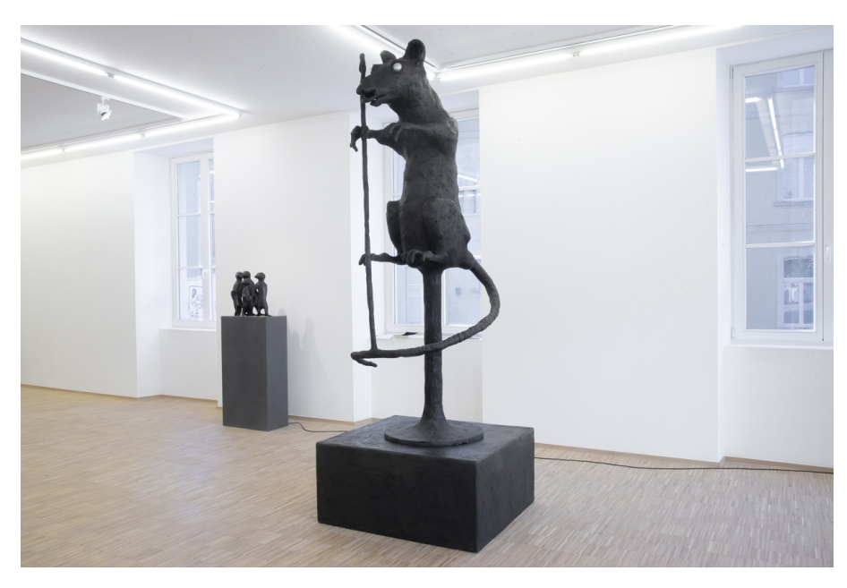
Rats and Rituals Exhibition View Nosbaum Reding, Luxembourg, 2025