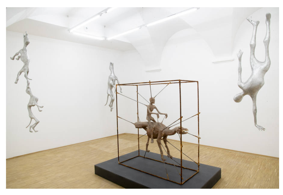
Rats and Rituals Exhibition View Nosbaum Reding, Luxembourg, 2025