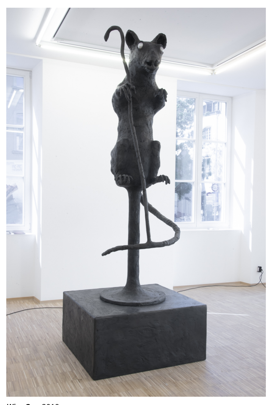
Wise Guy , 2019 Composite 39.37 x 31.5 x 166.14 in ( 100 x 80 x 422 cm )