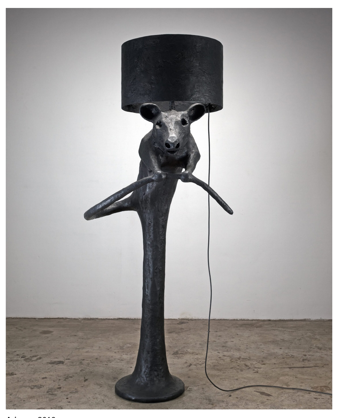
Arianne , 2019 Composite 35.43 x 37.4 x 84.65 in ( 90 x 95 x 215 cm )