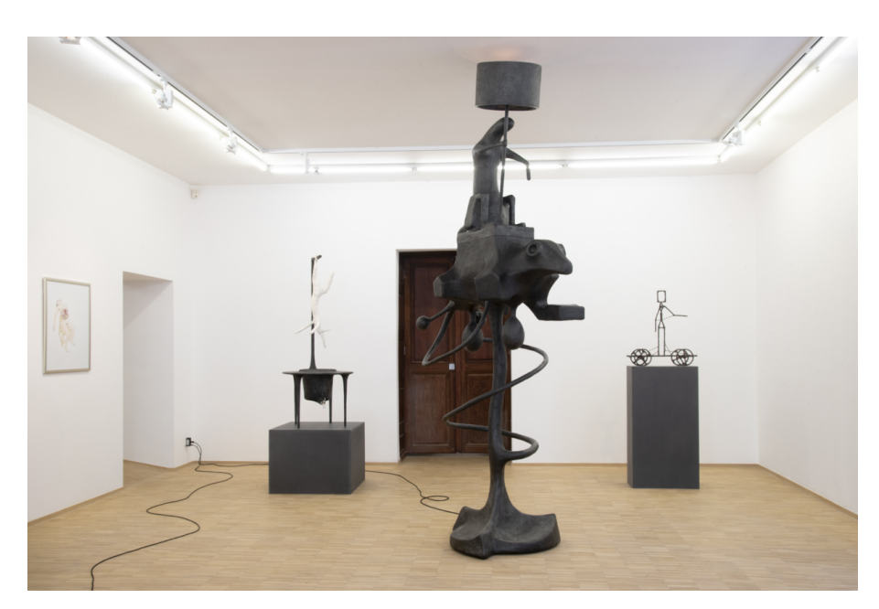
Rats and Rituals Exhibition View Nosbaum Reding, Luxembourg, 2025