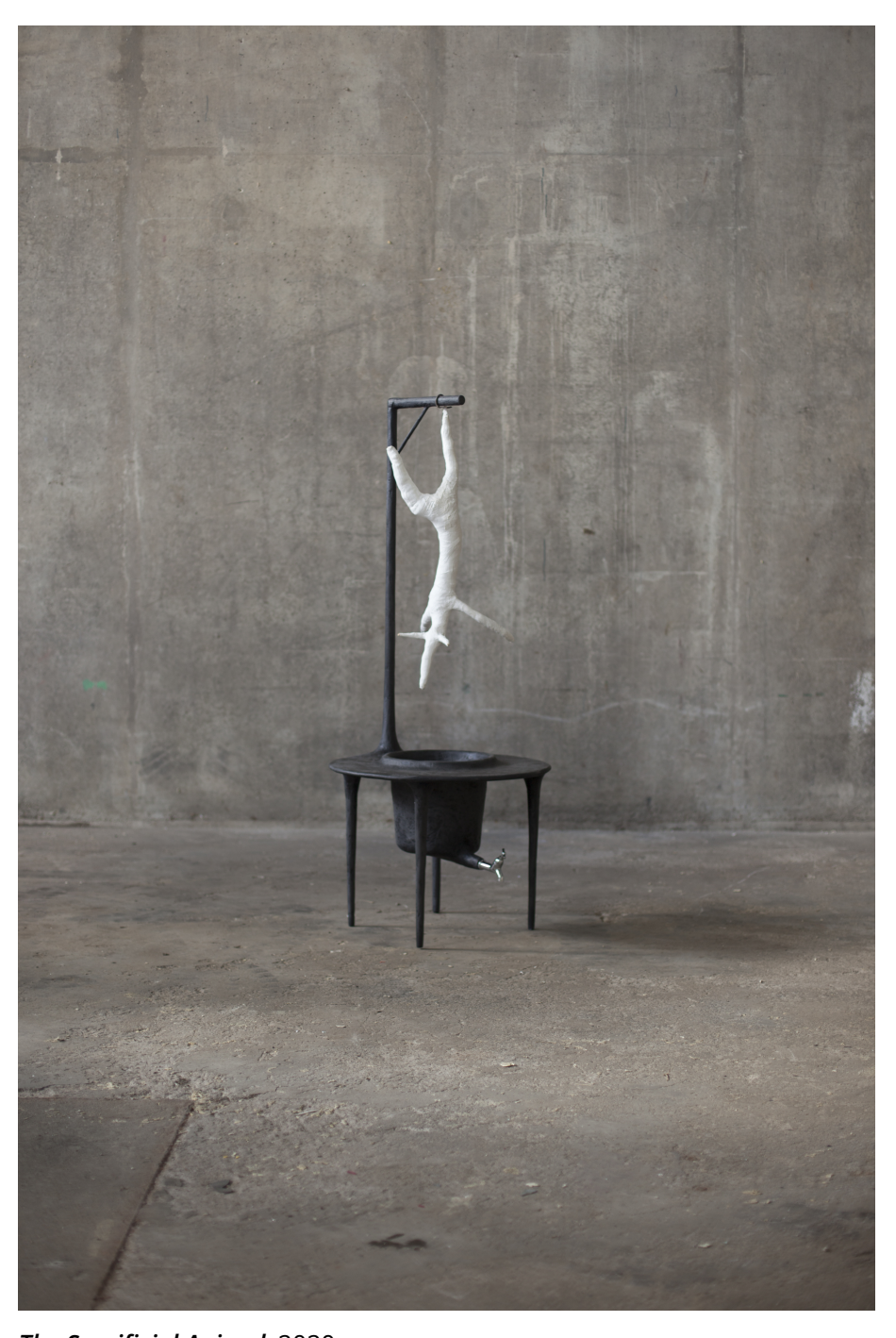
The Sacrificial Animal , 2020 Fiberglass 26.38 x 26.38 x 63.78 in ( 67 x 67 x 162 cm )