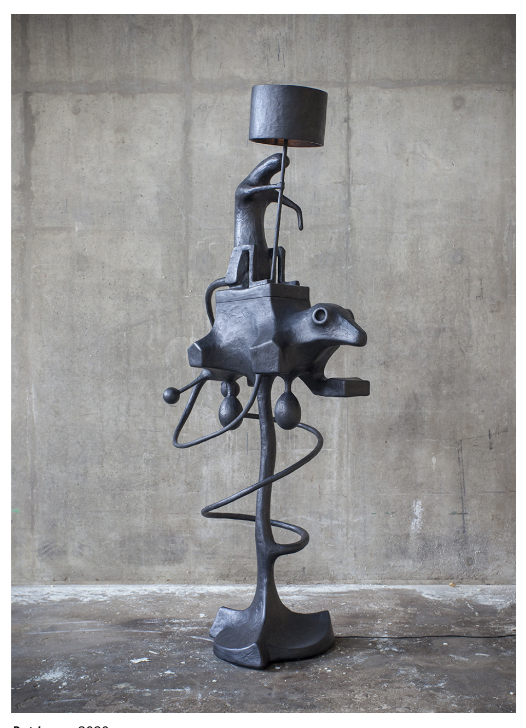
Rat Lamp , 2020 Fiberglass 122.83 x 59.06 x 29.53 in ( 312 x 150 x 75 cm )