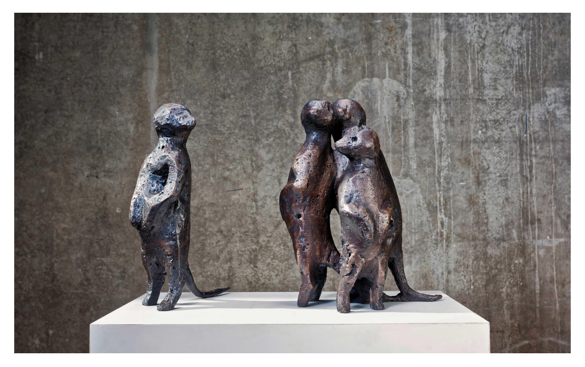
Meerkats , 2022 Bronze 17.72 x 12.2 x 17.72 in ( 45 x 31 x 45 cm ) Edition of 8 ex