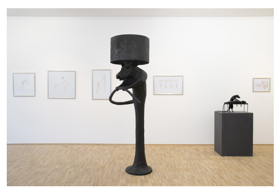
Rats and Rituals Exhibition View Nosbaum Reding, Luxembourg, 2025