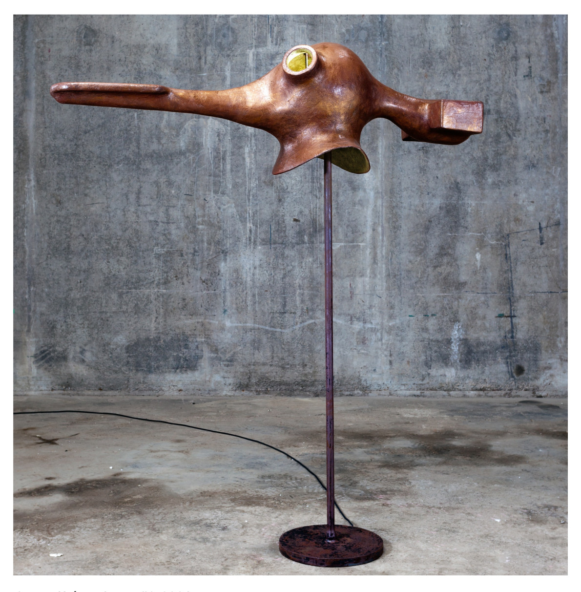
Crypto Helmet Lamp #2, 2016 Mixed Media 15.75 \times 13.78 \times 70.87 in ( 40 \times 35 \times 180 cm ) Edition of 3 ex