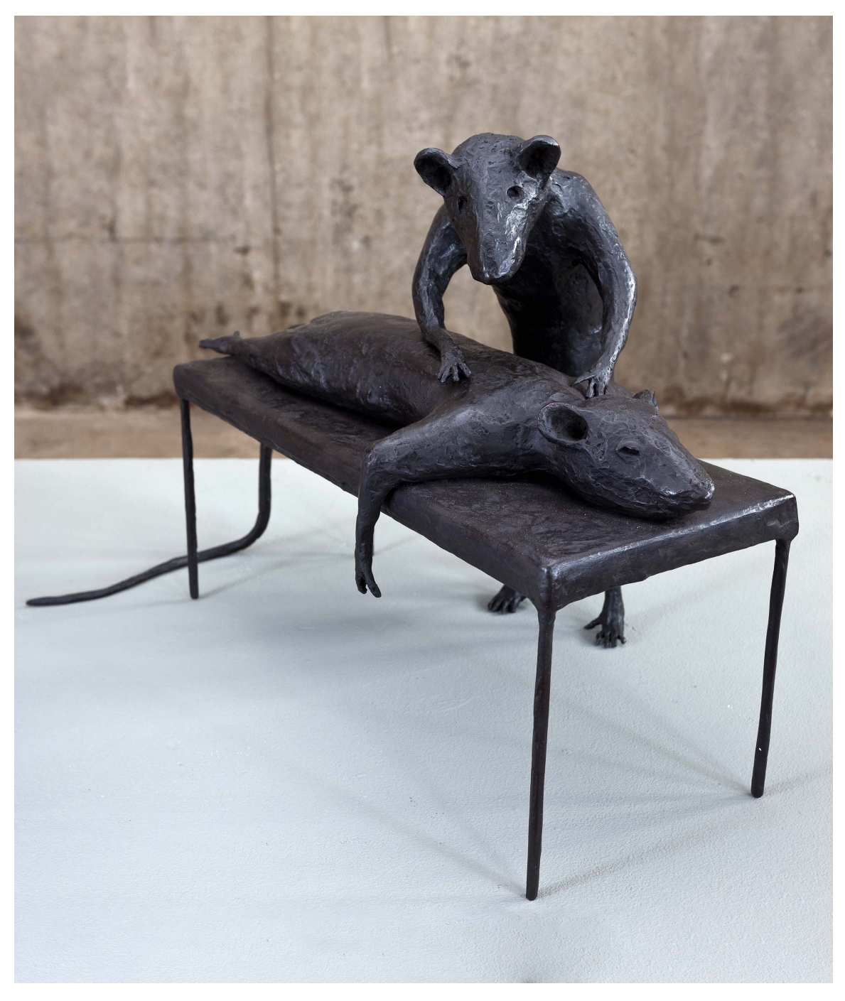
La Masseuse , 2021 Bronze 23.62 x 19.69 x 15.35 in ( 60 x 50 x 39 cm ) Edition of 8 ex