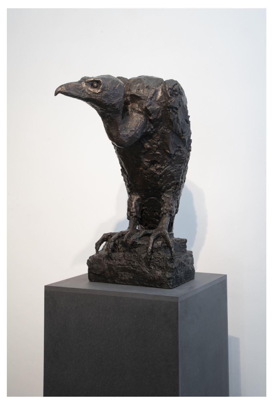
Vulture , 2024 Bronze 13.78 x 31.5 x 29.53 in ( 35 x 80 x 75 cm ) Edition of 8 ex