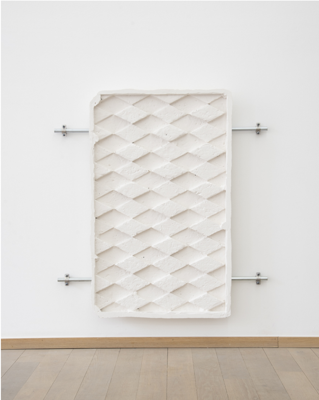
Untitled (Diamonds Are Forever) #6, 2025

Acrylic composite, pigments, galvanised steel tubes, fixing brackets 31.5 x 19.69 x 1.57 in ( 80 x 50 x 4 cm )