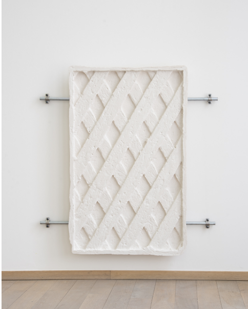
Diamonds Are Forever Exhibition View Nosbaum Reding, Luxembourg, 2025