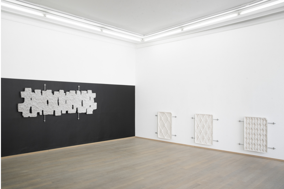
Diamonds Are Forever Exhibition View Nosbaum Reding, Luxembourg, 2025