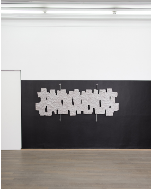
Diamonds Are Forever Exhibition View Nosbaum Reding, Luxembourg, 2025