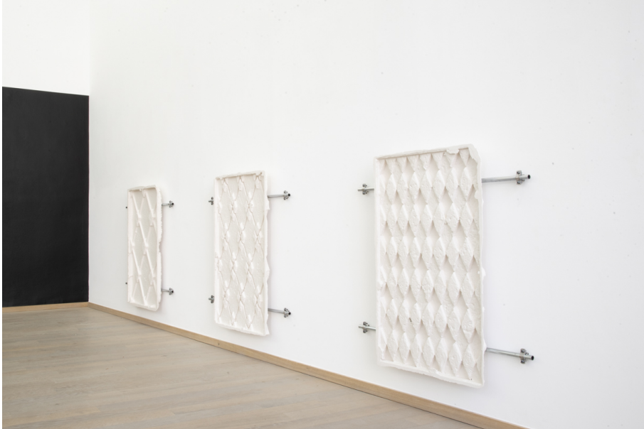
Diamonds Are Forever Exhibition View Nosbaum Reding, Luxembourg, 2025