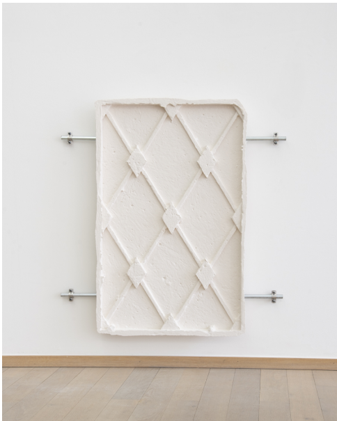
Diamonds Are Forever Exhibition View Nosbaum Reding, Luxembourg, 2025