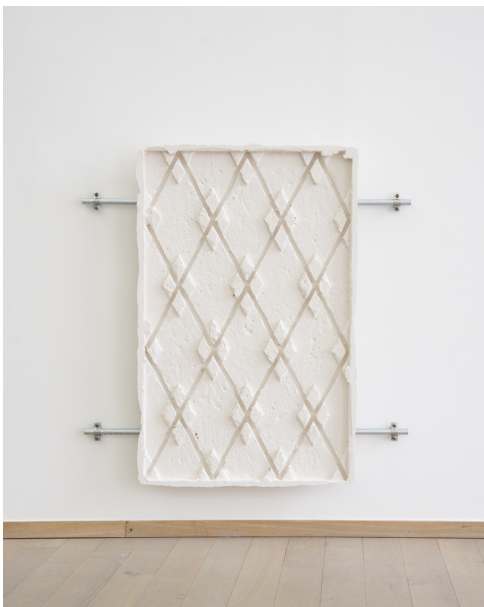
Diamonds Are Forever Exhibition View Nosbaum Reding, Luxembourg, 2025