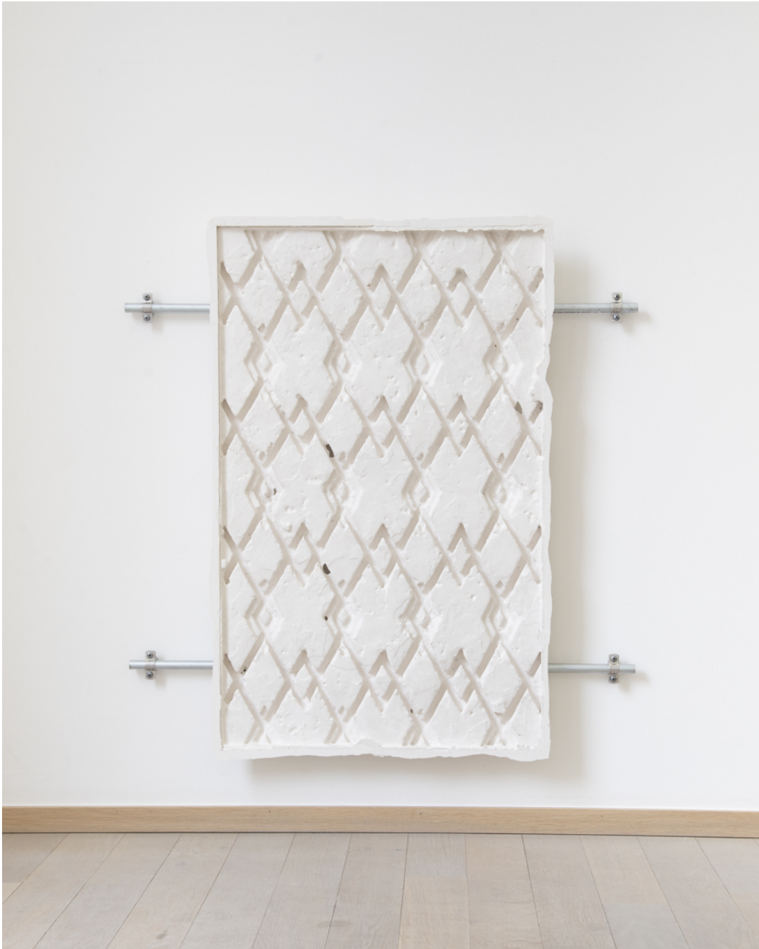
Untitled (Diamonds Are Forever) #2, 2025

Acrylic composite, pigments, galvanised steel tubes, fixing brackets 31.5 x 19.69 x 1.57 in ( 80 x 50 x 4 cm )