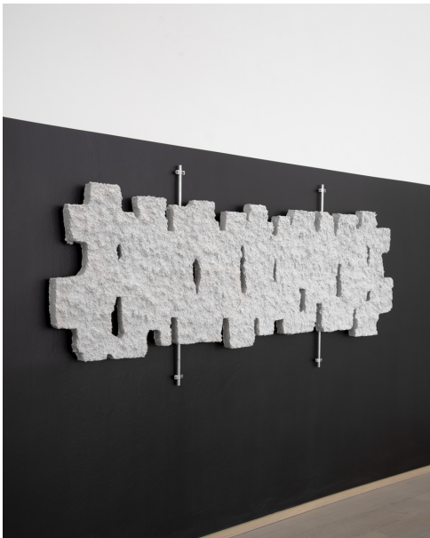
Diamonds Are Forever Exhibition View Nosbaum Reding, Luxembourg, 2025