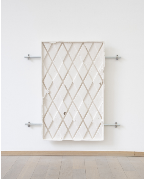
Diamonds Are Forever Exhibition View Nosbaum Reding, Luxembourg, 2025