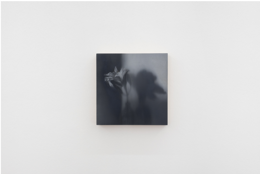
Hiatus Exhibition View Nosbaum Reding, Luxembourg, 2026