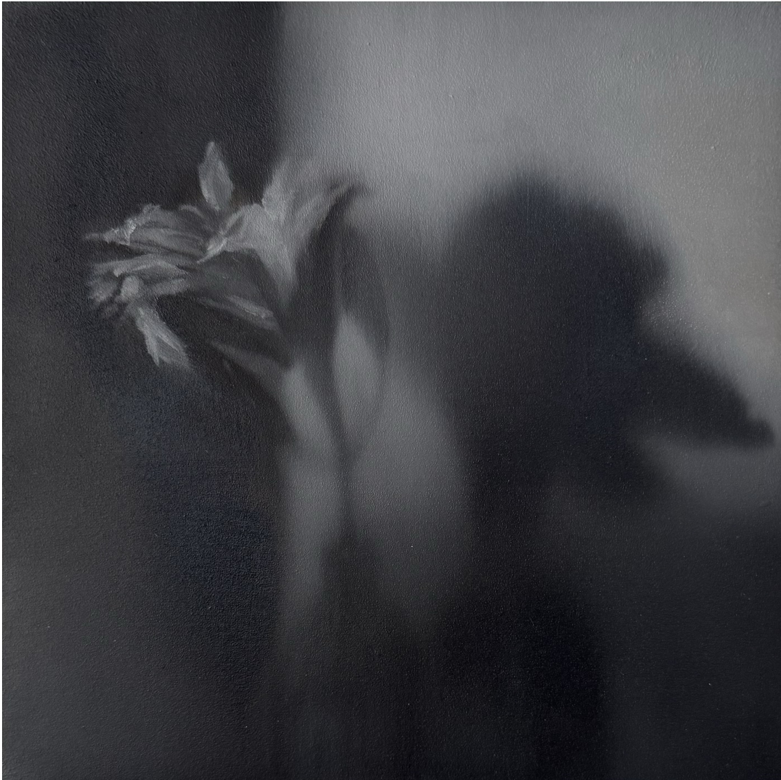
Flower , 2026 oil on wood 7.87 x 7.87 in ( 20 x 20 cm )