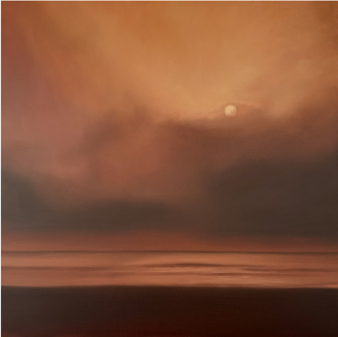
Seascape (1) , 2026 oil on wood 23.62 x 23.62 in ( 60 x 60 cm )