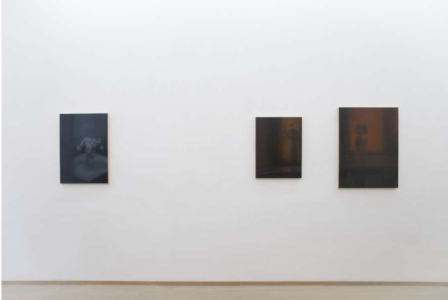
Hiatus Exhibition View Nosbaum Reding, Luxembourg, 2026