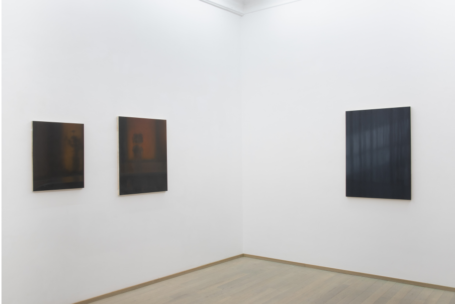
Hiatus Exhibition View Nosbaum Reding, Luxembourg, 2026