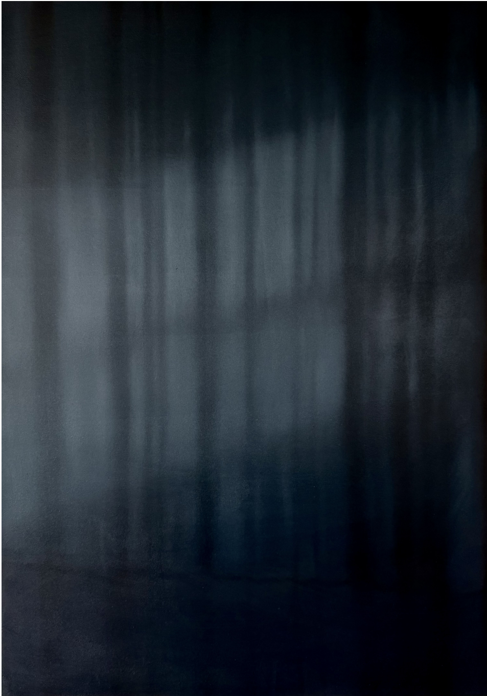
curtain (blue) , 2026 oil on wood 39.37 x 27.56 in ( 100 x 70 cm )