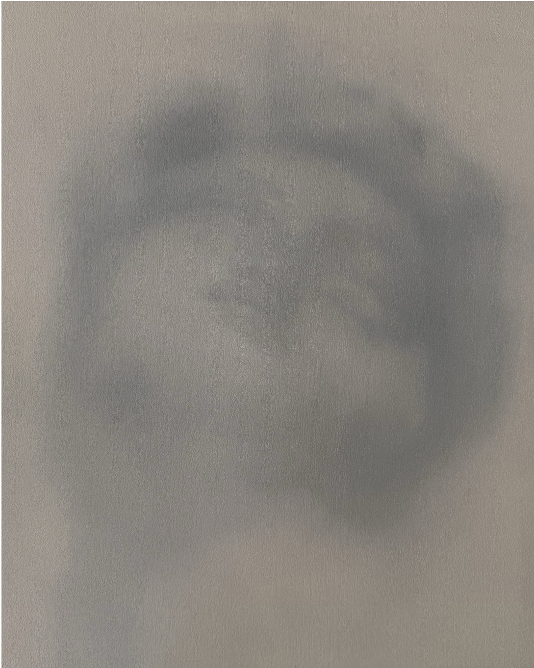
Head (after Tintoretto) , 2026 oil on wood 11.81 x 9.84 in ( 30 x 25 cm )