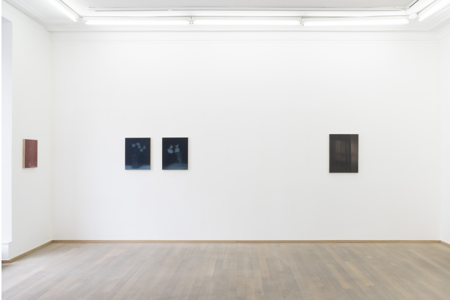
Hiatus Exhibition View Nosbaum Reding, Luxembourg, 2026