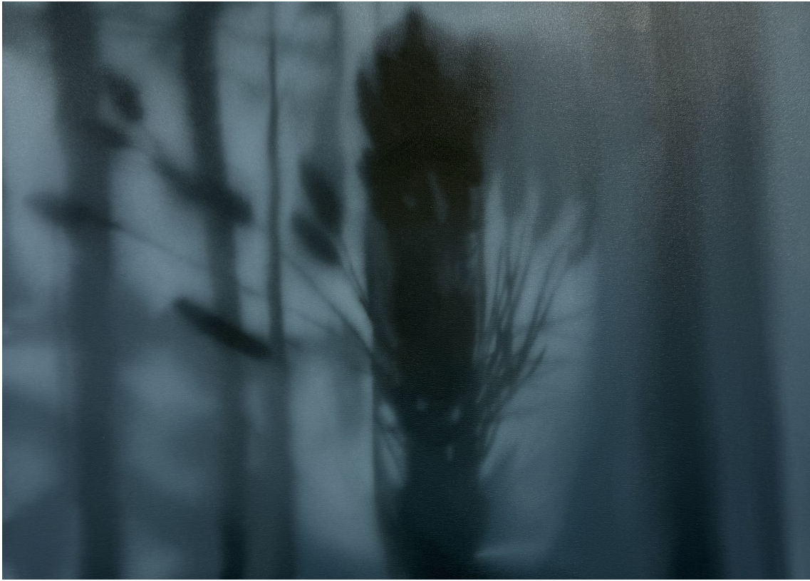
Interior with still life, 2026 oil on wood 17.72 x 23.62 in ( 45 x 60 cm )