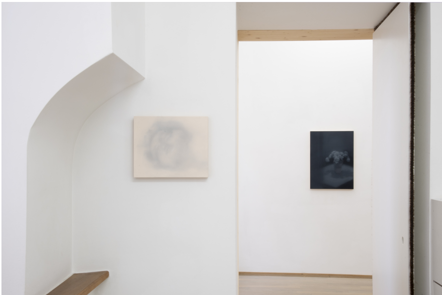
Hiatus Exhibition View Nosbaum Reding, Luxembourg, 2026