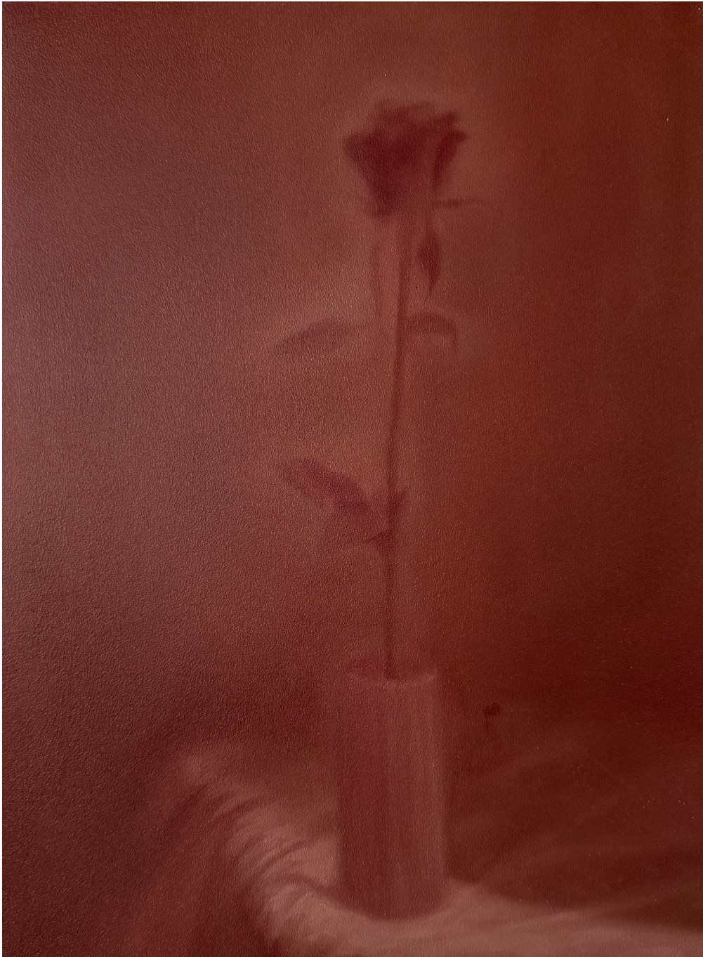
Rose in vase , 2026 oil on wood 15.75 x 11.81 in ( 40 x 30 cm )