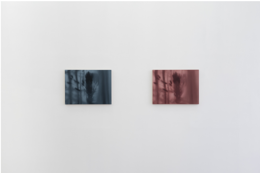
Hiatus Exhibition View Nosbaum Reding, Luxembourg, 2026