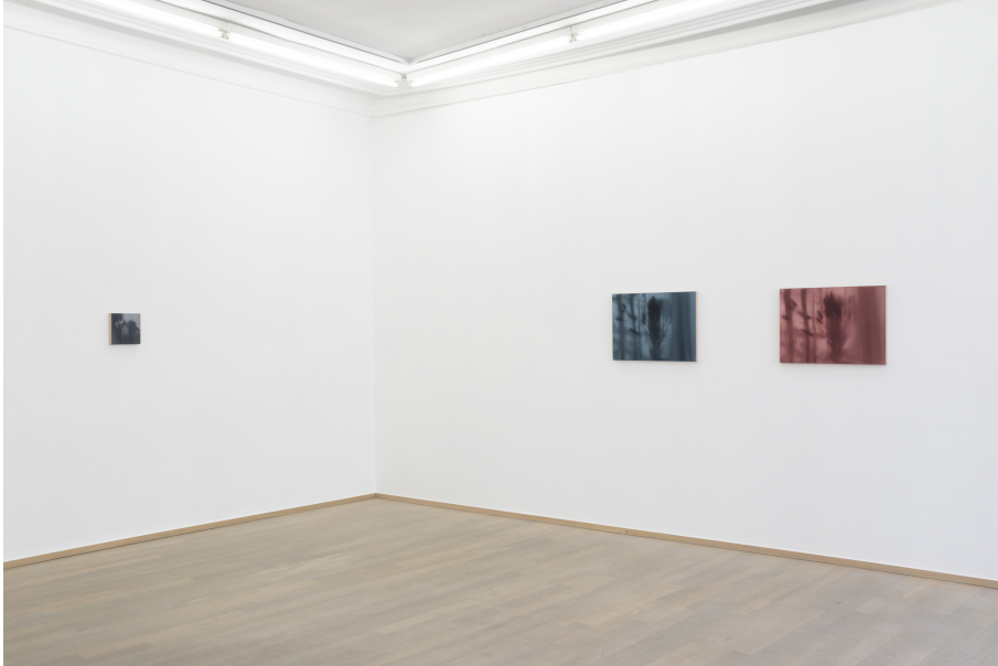
Hiatus Exhibition View Nosbaum Reding, Luxembourg, 2026