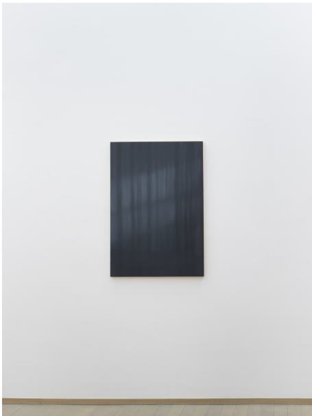
Hiatus Exhibition View Nosbaum Reding, Luxembourg, 2026