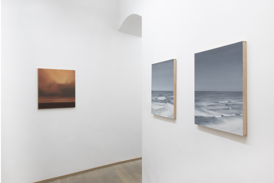
Hiatus Exhibition View Nosbaum Reding, Luxembourg, 2026