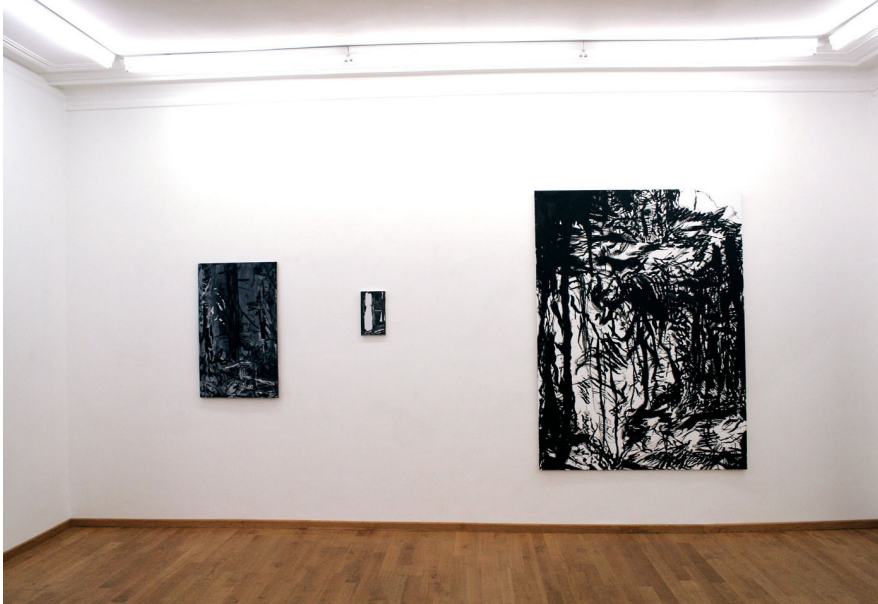
Exhibition View Nosbaum Reding, Luxembourg, 2008