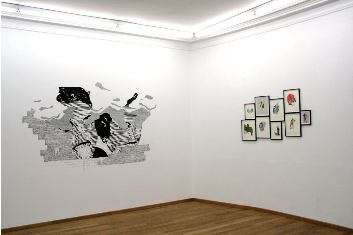
Exhibition View Nosbaum Reding, Luxembourg, 2008