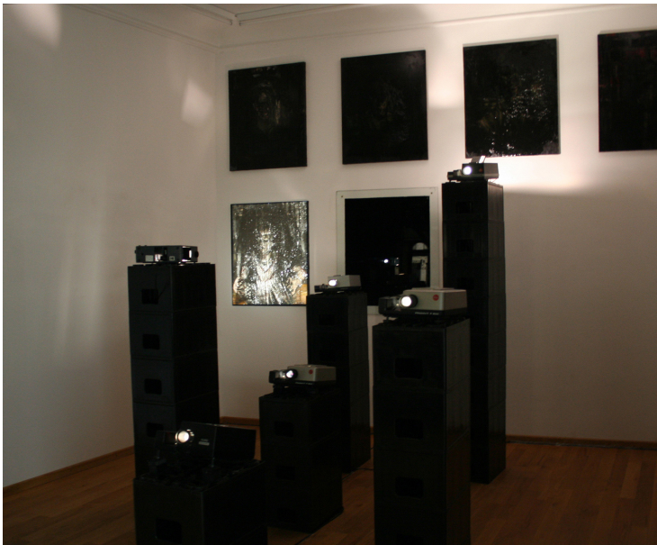
Exhibition View Nosbaum Reding, Luxembourg, 2008