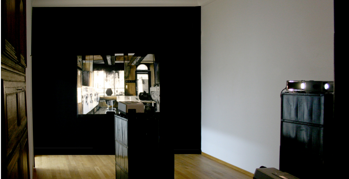
Exhibition View Nosbaum Reding, Luxembourg, 2008