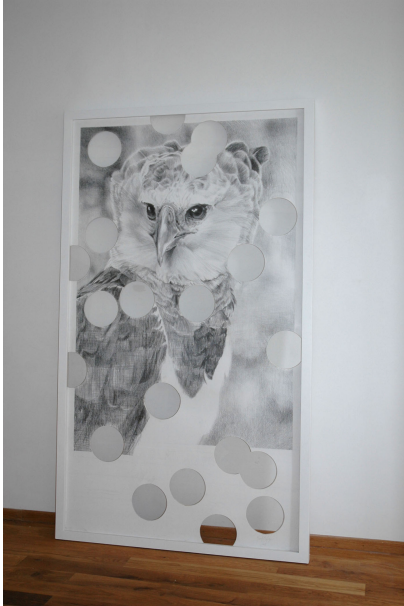
AJOUR. Petite ouverture laissant passer le jour ... Exhibition View Nosbaum Reding, Luxembourg, 2008