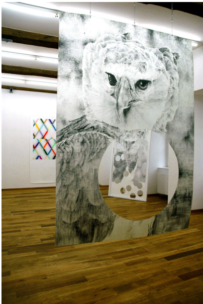
AJOUR. Petite ouverture laissant passer le jour ... Exhibition View Nosbaum Reding, Luxembourg, 2008