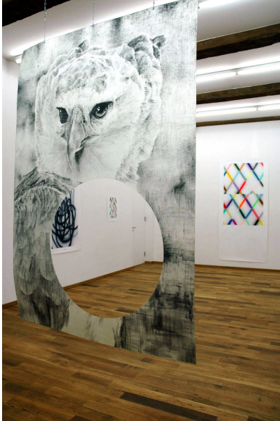
AJOUR. Petite ouverture laissant passer le jour ... Exhibition View Nosbaum Reding, Luxembourg, 2008