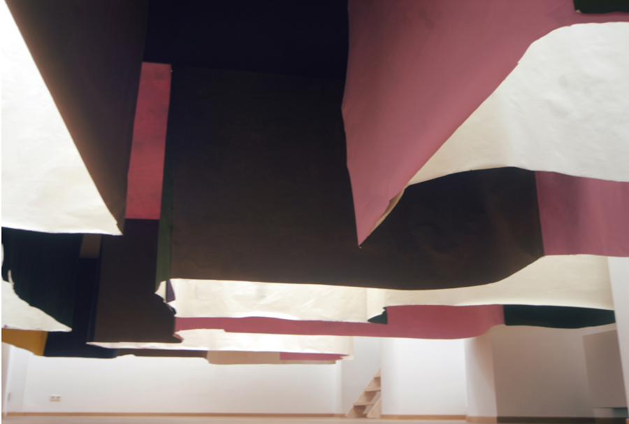
Labyrinth Exhibition View Nosbaum Reding, Luxembourg, 2007