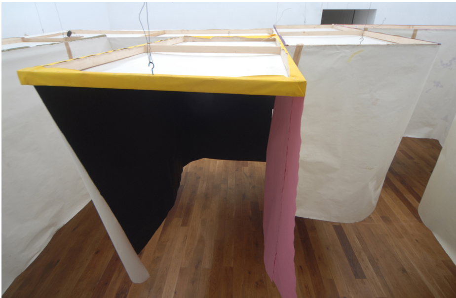
Labyrinth Exhibition View Nosbaum Reding, Luxembourg, 2007